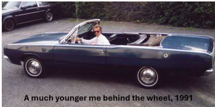
A much younger me behind the wheel, 1991

We all seem to have one: a long-lost love from many years ago. We still remember that first glimpse which took our breath away. "She's too good for me," you may have told yourself, or "I can't afford her!" But you chased her anyway, and for a short while, she was yours. Then priorities changed. She DID become too expensive to keep. Finally, maturity overcame your youthful yearning, and you let her go. Yet to this day, you wonder if you made a mistake and should have kept her.