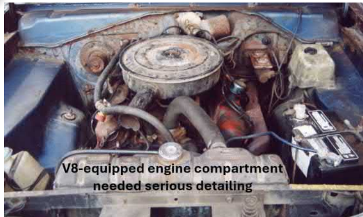
V8-equipped engine compartment needed serious detailing

exposed what appeared to be a brand-new floor welded in place. On the downside, the rear quarters showed some rust, the poor-quality repaint was flaking in places, and the driver's seat upholstery was patched with duct tape.