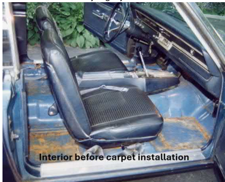
Interior before carpet installation

After two years of fun, it was time. My energies needed to be devoted to the Isetta's restoration, so off to a new home it went. Looking at photos now, I realize that this Dart had good bones. It strikes me as an ideal candidate for a rolling restoration: work on it while driving it. I missed the convertible experience so much that a few years after selling the Dart, I bought a Miata. THAT one stuck around for twenty-eight years!