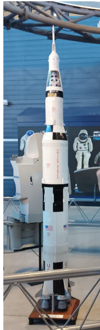
Model Space Rocket at the Udvar-Hazy Air & Space Museum

Copied with permission from AAG website blog page. https://www.autoappraisal.com/about-aag/for-what-its-worth/