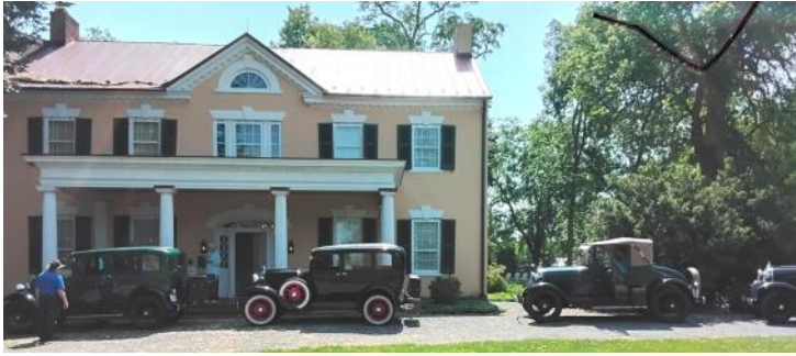
The Dodona Manor