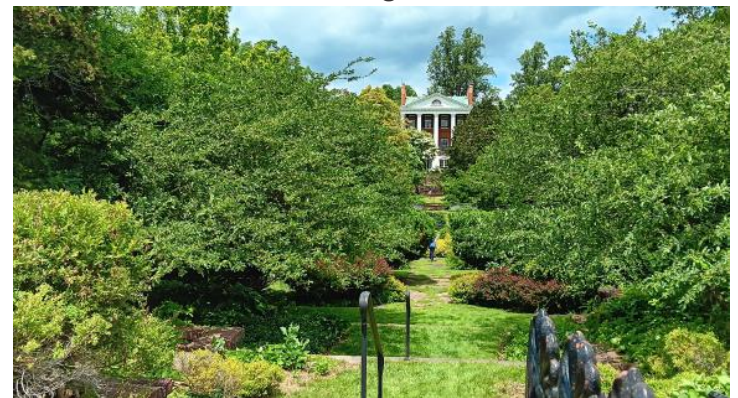
Distant view of the Oak Hill Mansion

different guide. Although some of the information was the same, each guide had a different field of interest, which definitely added to the experience.