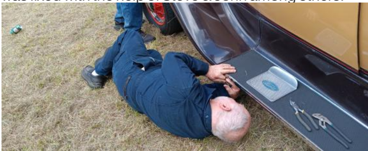
It's the old term "Get out and Get Under!"