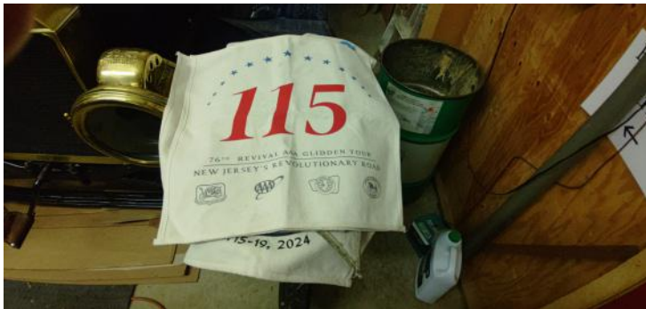
The car banner from our Glidden Tour