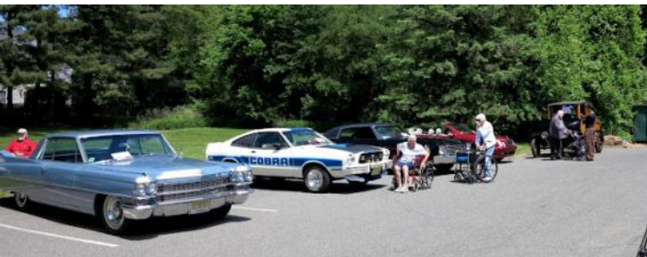
Residents enjoying the antique vehicle display

to arrive at 12:30 PM as planned and the car display was from 1:00 until 4:00 PM. Lunch was a help yourself meal provided for the car hobbyists that included a variety of cold cut, salad, sandwiches, soft drinks, bagged snacks, and freshly baked cookies. As in past years, the