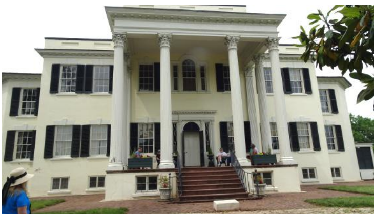
The Oatland Plantation

Mei-ling, wife of the president of the Republic of China, Chiang Kai-shek. Madame Chiang and the Marshalls became close friends when Marshall was President Harry Truman's special envoy to China. Over 90% of the furnishings and memorabilia in the house were owned