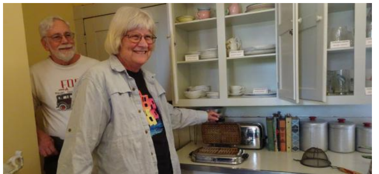
An early electric waffle iron