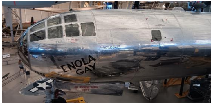
The Enola Gay Bomber