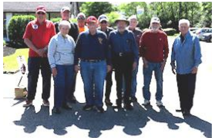
The antique vehicle owners.

typical when planning these events, we scheduled a Rain Date, so we used our Rain Date on Tuesday, May 20 th , which turned out to be an almost picture perfect and sunny day with scattered clouds and temperatures just