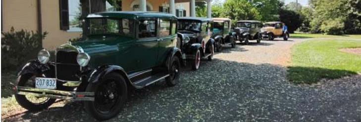
Our A's in the parking lot