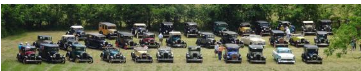
All the Olde Fords!