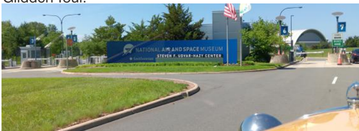
The Udvar-Hazy Air & Space Museum

of the day was to a private car collection. One of the most interesting I found there was a Glidden Banner from our Glidden Tour.