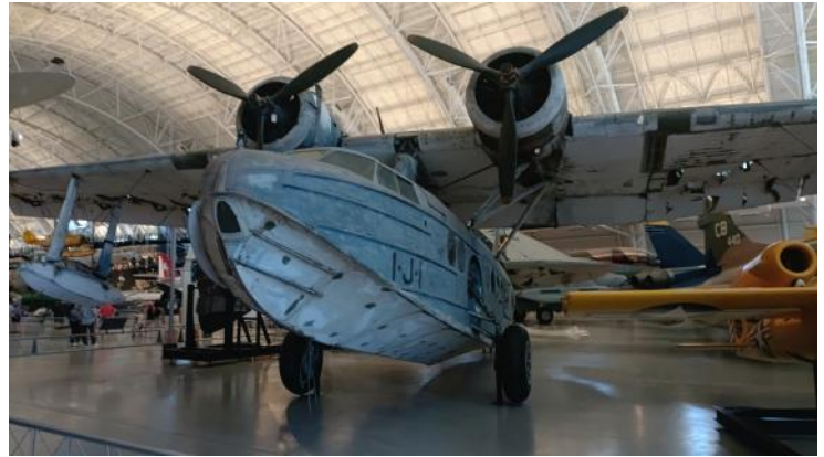
The Sikorsky S42 Flying Boat