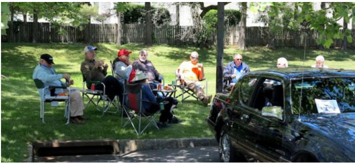
NJ Region AACA Members enjoying their lunches.