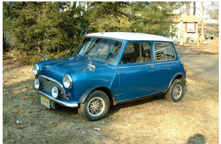
1966 Austin Mini

I now drive a 2012 Honda CR-V, so it's just an "antique in training".