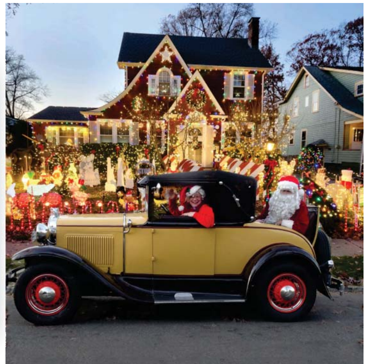
Santa and Mrs. Claus