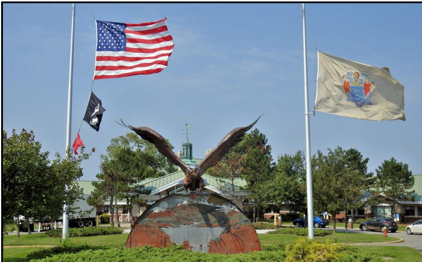
Our Annual visit to the New Jersey Veterans Memorial Home at Menlo Park is our special Thank you to those who have served our country with distinction.