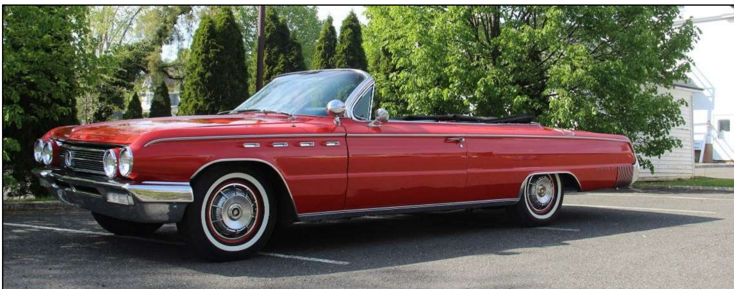
The Big Buick carries four VentiPorts per front fender, a trademark, and features a rakish restyle from 1961.