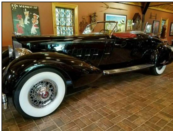
A dual cowl Packard, from the last visit to Dave Markel's Museum

We will be meeting at and leaving from the Wegman's Grocery Store located at 724 Route 202 South Bridgewater, New Jersey 08807. Please drive your antique or modern vehicles and depart your starting location in plenty of time to arrive at the meeting location by 8:15 AM as we will depart at 8:30 AM for a leisurely caravan drive to Skippack (Schwenksville), PA. We will meet Mr. Casale and proceed to the first building and start the tour at 10:30