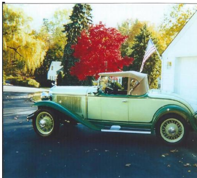
Read about Annabelle on Page 13