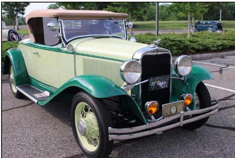
Annabelle all dressed up for an AACA National meet in Parsippany

In 1969 I learned from one of the mechanics at the Texaco station that the Dodge might be up for sale. I immediately went the 2 block to see Rita, now 88 years young, and offered to purchase the car. She agreed and left me with the