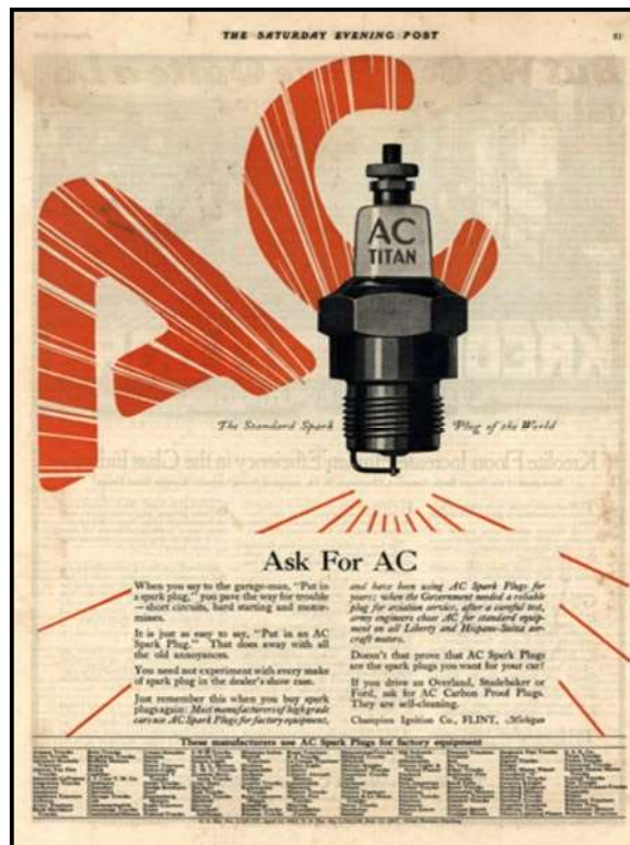
An AC spark plug ad from 1919