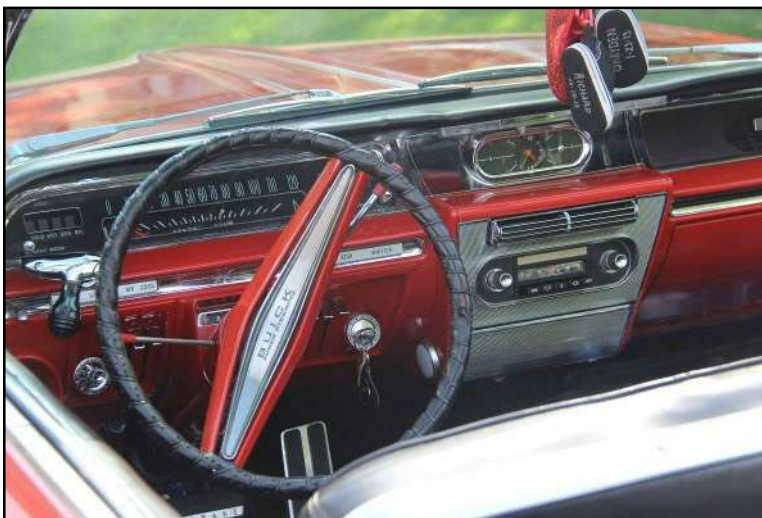
Exclusive to the Electra 225 was the Mirromatic Instrument Panel

So with that in mind I began thinking about looking for a modern car, something we could just jump into and not worry about any of that travel stuff, you know, just get in and enjoy the road. Like everyone else I started surfing the internet at cars and not knowing just what I was looking for, but I would know it when I found it. One day a pretty 1962 Buick Electra 225 Convertible comes up for sale in Warminster PA at a GMC dealership. I think that's a strange trade-in but it wasn't it belonged to the owner of the dealership. I wasn't looking for a particular make or model as I like all old cars because they are so unique but a car we could drive anywhere and have fun with. After seeing the Buick I kept looking to see what else