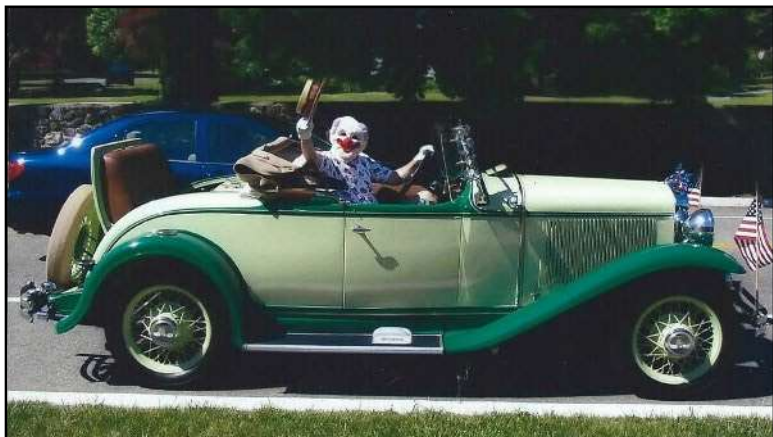
Why not have some fun while you ride in a parade??

statement "don't you ever sell my Annabelle". I drove it home the very next day in a snow storm. I immediately replaced the side curtains and top because the resembled burnt toast. For many years it was my go to car for NJ region events and I maintained it's original condition. In 1990, being a recently retired individual I gained access to a local garage bay and began the chore of restoring the Green Dodge. Over the course of the next 3 years it was a complete body off, engine out restoration with a new top and complete upholstery. Over time I kept a complete log of the work and hours spent and wondered why I had taken on this project. The frustration at times was worth it as I am proud of the outcome and have continued to enjoy the use of Annabelle in activities with the NJ Region and beyond.