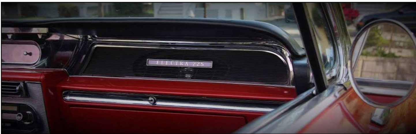
The Safety Option Group included a padded dash, accessory group and custom moldings and a glove box light.

FM with the twist of the off and on knob while keeping the original appearance. The last and coolest upgrade was replacing the original dash lights with LED, most original dash lighting comes from old bulbs and is very dull but LED brings the dash and all the gauges to life makes the car interior pop and easier to see while night driving. The Buick has been displayed in the Car Museum in Point Pleasant with other Buicks to Somerville cruise nights, Cranford car shows, a drive-in movie event in Wall Township and with other cars from the AACA we got to drive around the warning track at Patriot Stadium.