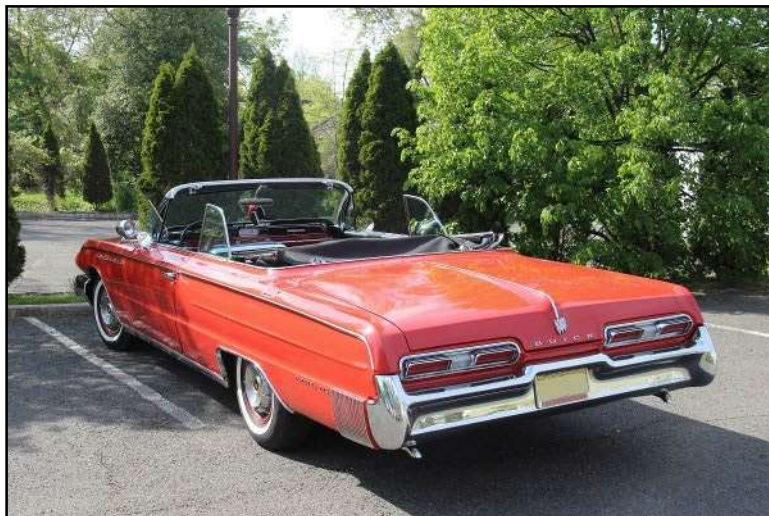
Buicks largest, plushiest and most expensive model for 1962 the Electra 225

towards a convertible as I never had one so that became a plus. The car presented itself very nicely with