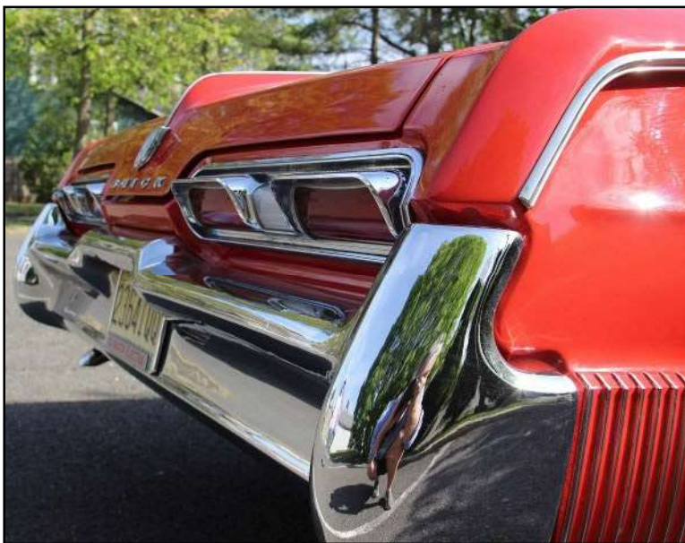
Standard on Electra 225 were back up lights and parking lamps.

All this brought us to the next item in a 50 plus year old car wiring. It was decided to replace the wiring with a new color coded harness making the car safer for the long term. Then we looked at convenience items the cigarette lighter was changed into a charging port for the cellphone or a