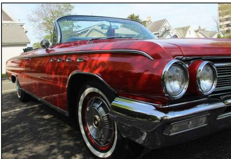
Super Deluxe wheel cover with Gold accents were standard on the Electra

The improvements and upgrades brought the Buick into the 21st century the only mechanical issue has been the generator and alternator which I recently had rebuilt other than that there have been no problem with car which the previous owner took very good care of it. It runs great, looks great especially with the top down Carol and I look forward to enjoying it for many more miles and years.