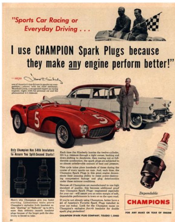
An ad from 1954 for Champion spark plugs

cles have spark plug replacement intervals which hover around 100,000 miles.