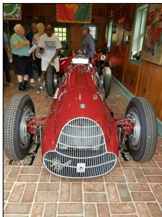
Juan Manuel Fangio's Alfa Romeo 158 this is royalty