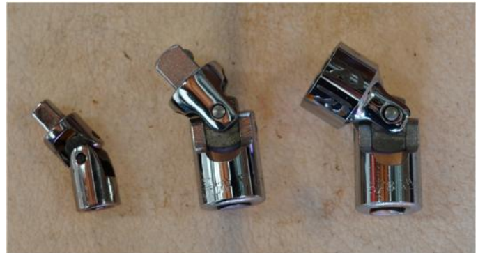
U-joint extensions are available as 1/4", 3/8" and 1/2" drive as well as sockets

ratchet handles to ensure that the tool sits squarely on the fastener. Once I was unable to remove the final bolt holding a starter motor in my Mustang until I drove to the hardware store and bought a 1/4" drive u-joint adapter. With that $5 tool, that bolt came right out, but I wasted 2 hours trying it with the wrong tools.