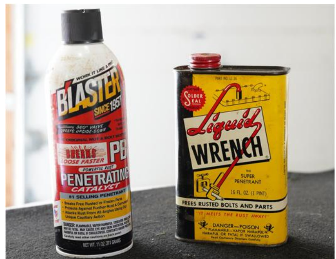
PB Blaster spray operates with can upside-down; 'liquid' Liquid Wrench allows lengthy soaking

Now that you have the best tools on it, do you need more leverage? BEFORE GOING FURTHER, accept the possibility that additional force may break the fastener. If that happens, will you be able to drill out the broken stud, or is the component ruined? Before you get out the breaker bar, try breaking that bond using chemicals or extreme temperature changes. Well-known solvents like Liquid Wrench or PB Blaster are readily available, and at least one should be a stock item in your workshop. When I've restored cars, I've used non-aerosol cans of Liquid Wrench in liquid form which allowed me to completely immerse components for an overnight soak (an advantage to removing the part from the car). Patience is key: liberally spray the fastener and give it a chance to do its job; this could be several hours and could involve multiple applications.