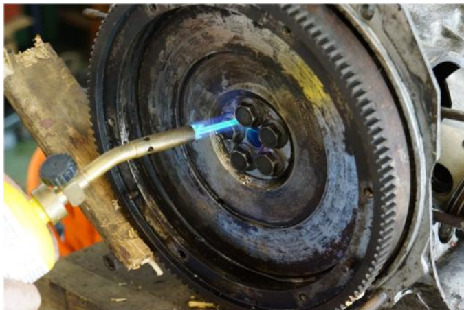
To break these bolts loose, heat is aimed at flywheel, not the bolts

If that didn't do it, a temperature change might. Let's understand the principle at work: when heated, metal expands. If it's possible to heat the component into which the bolt is threaded, the metal will expand AWAY from the fastener, breaking the bond. Try to avoid heating the fastener itself. Of course, be certain that the component can tolerate heat (must I say not try this on stuck fuel pump bolts?) and make sure that the heat isn't excessive. Small propane tanks can be bought in any hardware store. Keep the flame focused on as small an area as possible, and without burning yourself, try the tool on the fastener as soon as you remove the heat source.