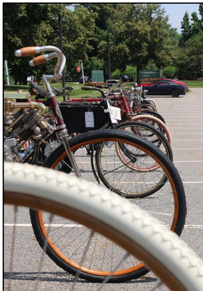
The show field at an AACA event can yield terrific history.

Day of event mobile phone (732) 433-5319