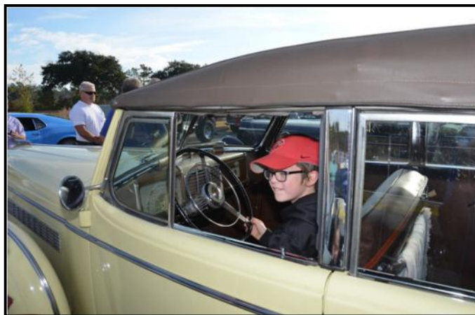
Another Future Hobbyist enjoying a photo op at Cars and Coffee