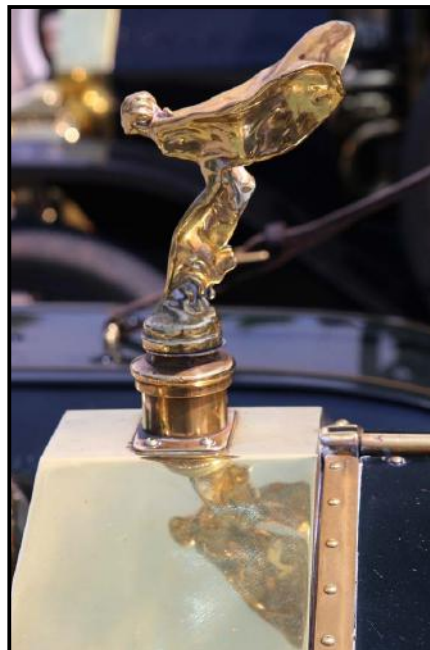
Can you name this Radiator Ornament?