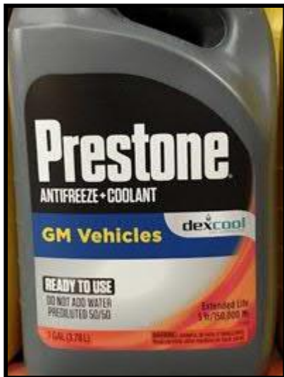
If your GM vehicle requires DexCool, this is the stuff to buy

mixed". The latter is easier to explain so we'll take that first. "Concentrate" is 100% antifreeze and it requires that you mix it 50/50, again, ideally with distilled water. If you would rather not bother with that step, then purchase the pre-mixed stuff, but be aware that you're paying for water. On a price-per-ounce basis, the concentrate is the better value, but the pre-mixed is more convenient.