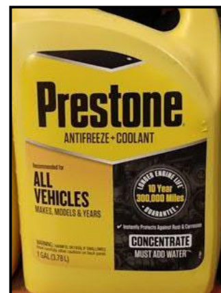
They look alike, but the bottle on the left is pre-mixed 50/50, while the bottle on the right is "concentrate" and states "must add water".

Walking into an auto parts store (or doing an online search) will cause you to come face-to-face with a plethora of antifreeze choices. You will find green, yellow, pink, and orange, plus "concentrate" and "pre-