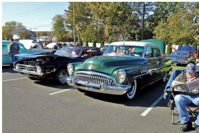
1953 Buick Special

AACA and numerous members of the New Jersey and New York car hobby community. Car enthusiasts kept arriving to the point that the display area in the front of the school was full and show cars had to be routed to the parking area at the back of the school. This area also started to fill up. Merchandise vendors were located in both areas. The $20 show registra-