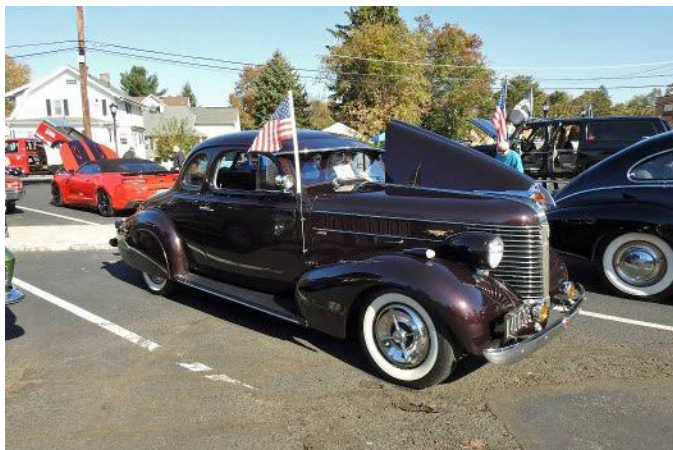
1938 Pontiac Custom