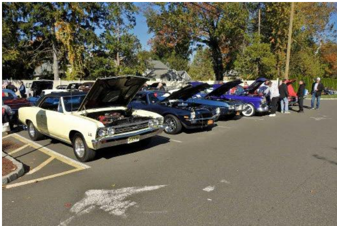
The Muscle was there for sure

At approximately 2:00 PM, Hot Rod Mike, asked all show vehicle owners to assemble near the registration tent. Each car identification placard had a raffle ticket attached. The mate to those tickets were