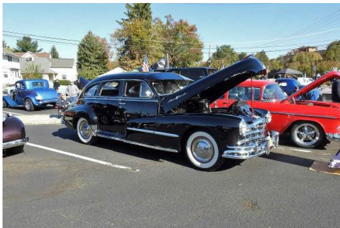
1948 Pontiac Stream Liner