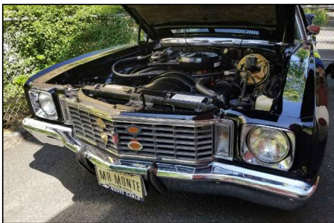
A nicely detailed 4bbl Chevy 350 powers Mr. Monte