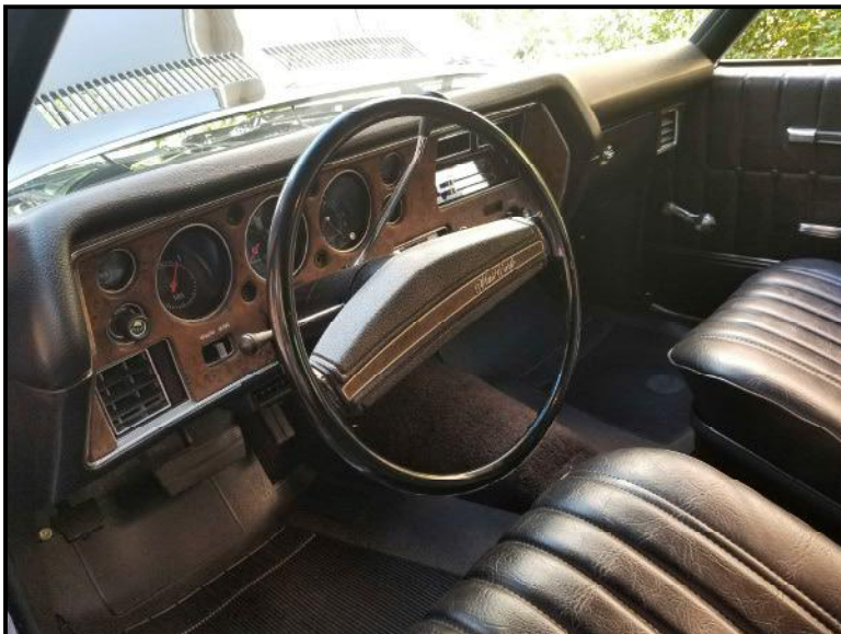
A well appointed and stylish dash