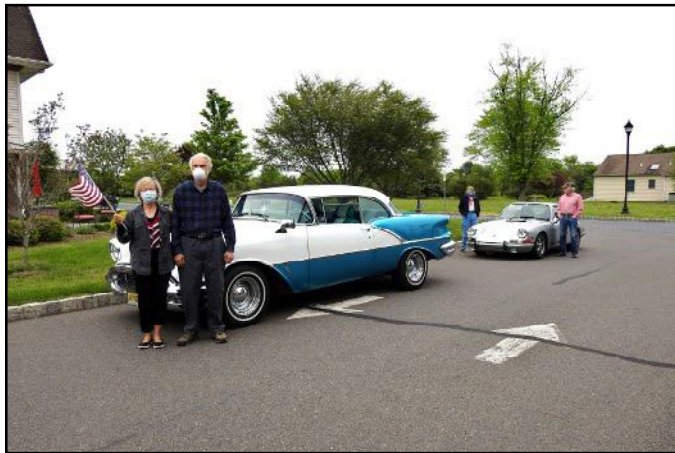
Social Distancing & Face coverings are the new norm

The annual Hillsborough Memorial Day Weekend Parade was cancelled May 1st. The day before, I received a call from the Director of Activities for an assisted living and rehab location looking for vintage cars. They would like to do something short and fun to show appreciation to their staff for a job well-done and for the challenges ahead