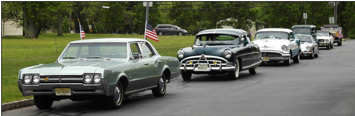
NJ Region members Ready to show the staff a little sunshine in appreciation for their dedication

Now that I committed, I had to write a Road Map piece, get something to our website Events, inform everyone a change in dates, look at Google Maps/Satellite to see how we'd parade around each site, send out driving directions, send a list of cars to