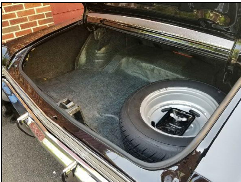
A roomy trunk, looks like the day it rolled from the showroom

Mr. Monte was special ordered by Susan, because she had her own unique requirements. The car was ordered with bucket seats and no console. She drove three ladies to church every Sunday, and she wanted the space between the seats for her purse. The base price was $3,416.00, which included power steering, power front disc brakes, 165hp