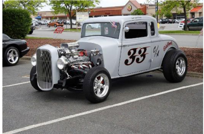
Nice Coupe right? Take a look at the efforts of the GHC's for the local Food bank on page 11

Your newsletter is the one thing that is still going on through all of this. Be a part of it!! Keep your fellow members informed. Your chapter or region will be stronger and kept closer together because you did!!