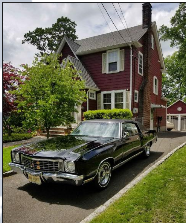
Greg Roser's Monte Carlo is This Months Cover Car on Page 12