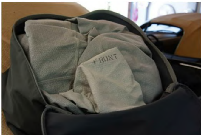
Car cover is folded with 'front' label exposed, and stored in its own bag.

W ay back in the December 2019 Road Map, the Repair Ramblings article highlighted the steps to take when salting away the collector car for the winter. Taking the toy out for its inaugural ride of the spring season is mostly a reversal of those steps, with a few extra checks thrown in for good measure. Even if you did nothing more than park the heap and throw an old blanket over it, there are still some preventative measures to follow for the safety of you and others with whom you share the road.