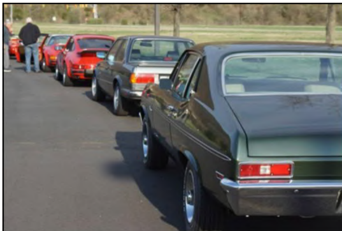
A properly prepped car lets you enjoy that first drive worry-free

Place it in gear, but before you move, test the brakes to ensure you have a firm pedal. Ease out of the parking spot, and take it easy at first. You probably know your own car well enough that you will have a good sense if everything feels right. And if it does, enjoy the drive!