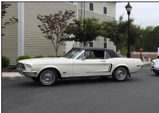
Al's excellent 68 Mustang

A short trip up Rte. 206 North we arrived at a familiar place, All American Assisted Living. We somehow squeezed into their front 'u' shaped driveway and gave residents and staff a good view from the front porch. After a little while we did 2 loops around the parking lot for residents on that side of the building. At 14 cars we caught up to the last car (like a cat catching it's tail). We managed, after some stop and go, to get out of our self-made traffic jam and back to the front of the building. This time we double parked so everyone could see us in all our glory in a more compact area. In addition to residents and staff being thrilled, Melissa Eckhart, our contact, and the