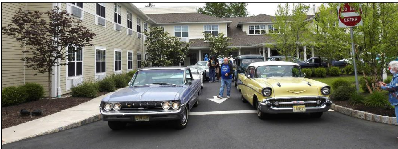
A pair of Pritchett cars lead the procession

At this point I was fishing for volunteers, not sure if I would get a bite. I put the word out and while I had a 12 vehicle limit, in 2 days we meet our goal! Responses like "Can't wait", "I'm itching to get driving again", etc. were the norm. Game on.