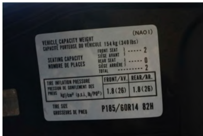
Newer cars have a tire pressure label on a door jamb. Rely on it this information..

I've successfully conquered flat-spotting by overinflating my tires during winter storage. In the Miata, I pump the rubber up to about 45 psi, which is pretty high. When re-setting the pressures, check the owner's manual or tire pressure label for the correct figures. The Miata calls for 26 psi; one year, I was so anxious to take that first warm spring drive that I forgot to reset the tires, and my little sports car rode like