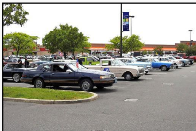
Ann & Abe Platt's 1988 Cougar LS heads up a long line of beautiful cars

Members of various New Jersey car clubs were invited to volunteer to display their vehicles with the purpose of participating in the Drive-Thru Food Drive with a display of classic cars of all types. The invited volunteers each made a $20.00 pre-registration donation and most also donated bags or cases of food. One person donated several approximately 200 loaves of bread. All display vehicles were staggered to meet "Social Distancing" guidelines (10 feet apart) and all "volunteers" were required to wear face coverings and to maintain guidelines (6 feet or more apart). Since some of the social distancing guidelines were recently relaxed some spectators, in small groups, were allowed to walk through the display area. Several other spectators were happy to be allowed to drive around the perimeter of the display area after dropping off their food and/or cash donations.