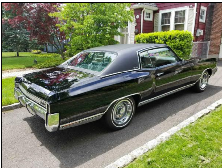
From any angle, Mr. Monte shows off perfect proportions

350ci 2-barrel V8 with 3-speed column shift manual transmission, clock, glove box light, 2-speed wipers with washer, back up lights, front seat shoulder belts, and full wheel covers. Everything else was optional. She ordered the following options: Soft-Ray tinted glass $46.35, Strato-Bucket vinyl front seats $136.95, door edge guards $6.35, black vinyl roof covering $126.40, 4-season air conditioning $407.60, Turbo Hydra-matic 3-speed automatic transmission $216.50, G78 x 15 belted white stripe tires $32.30, AM/FM pushbutton radio $139.05, bumper guards $31.60, color keyed rubber floor mats $13.00, and 15 x 7 rally wheels $42.00. The total sticker price including the destination charge was $4729.10.