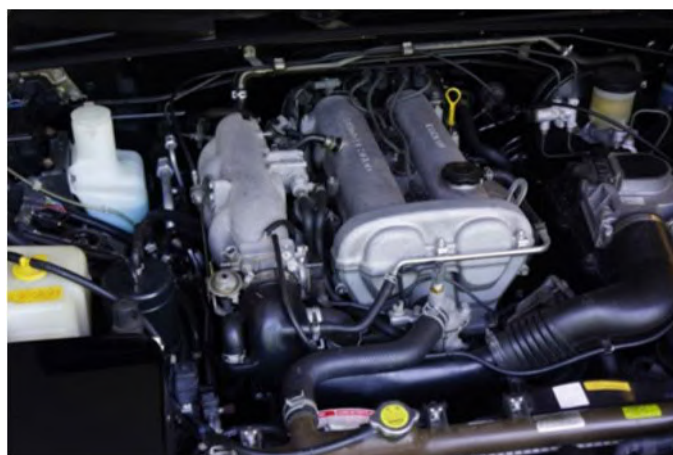
Semi-transparent containers allow fluid level checks without removing caps

Although usually not checked during storage prep, you definitely want to open the hood and check the