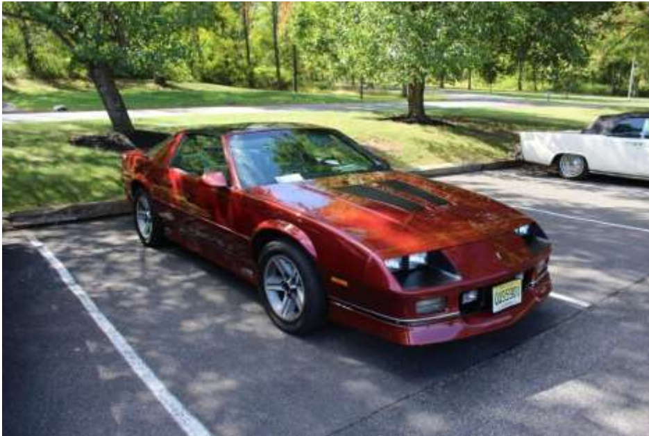
Chevy Camaro, owned by Bob Kelly , No.25 in 2017 Participation Points (File Photo)