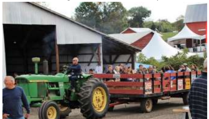
"Hayrides" were given to spectators

The Road Map – December 2017 New Jersey Region Web Site http://njregionaaca.com