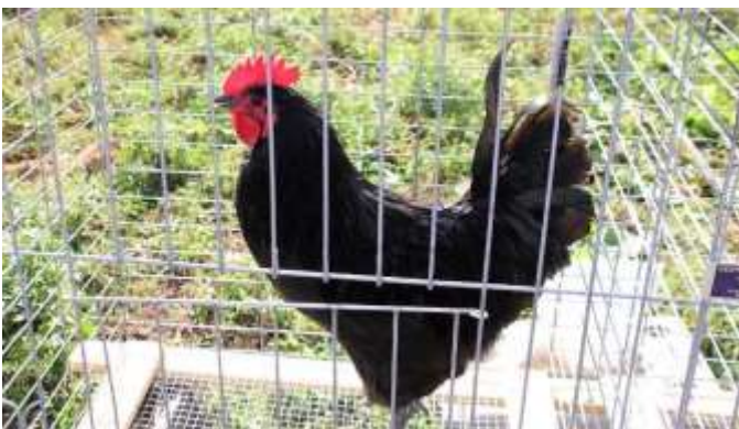
There are also chickens on the bison farm