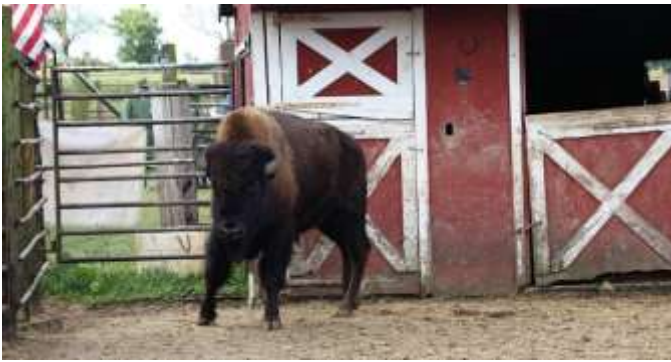
Bison on the bison farm