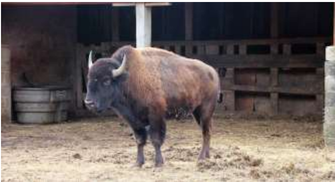
Bison on the bison farm