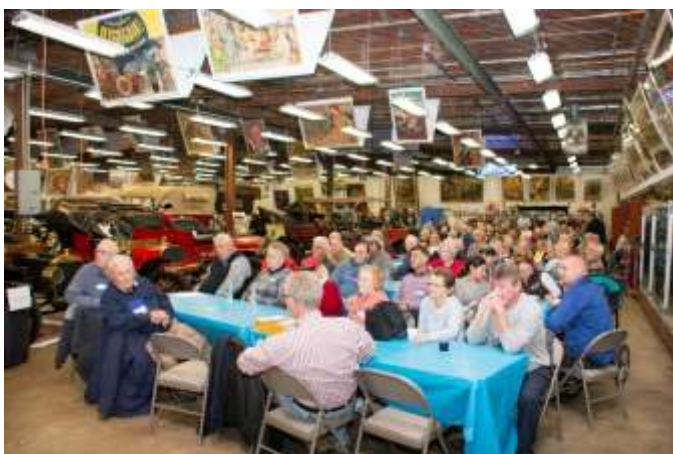
The membership. What a great venue for the "Old-timer's" meeting!