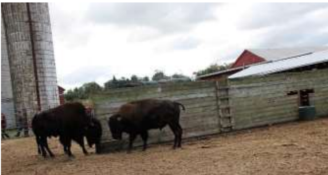
Bison on the bison farm