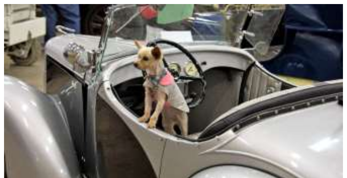
Herb Singe's dog "Sweetie"