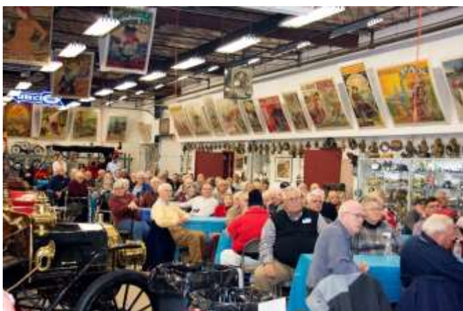
Another view of the meeting in the Singe Museum.