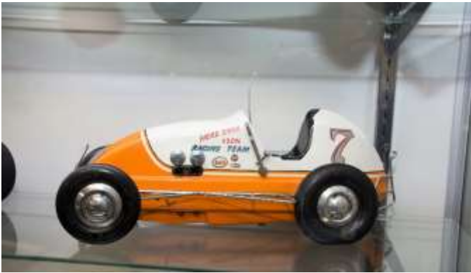
One of the literally thousands of artifacts, toys and memorabilia in the Singe Museum