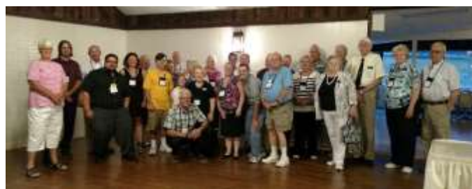
NJ Region members at the closing banquet

Please support our advertisers by patronizing them! They support us!!