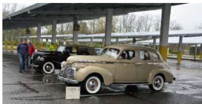
The cars of Class 3