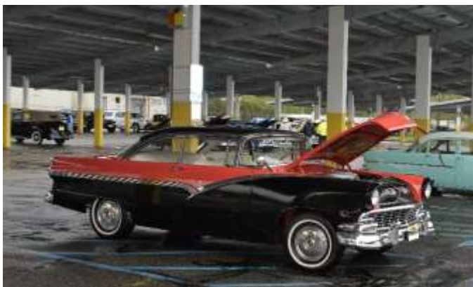
1 st Place - Thomas Whitmore's 1956 Ford