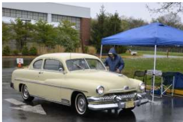
Bernie Cooney checking a show car in