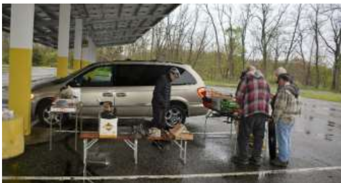
One of the 2 flea market vendors who came.