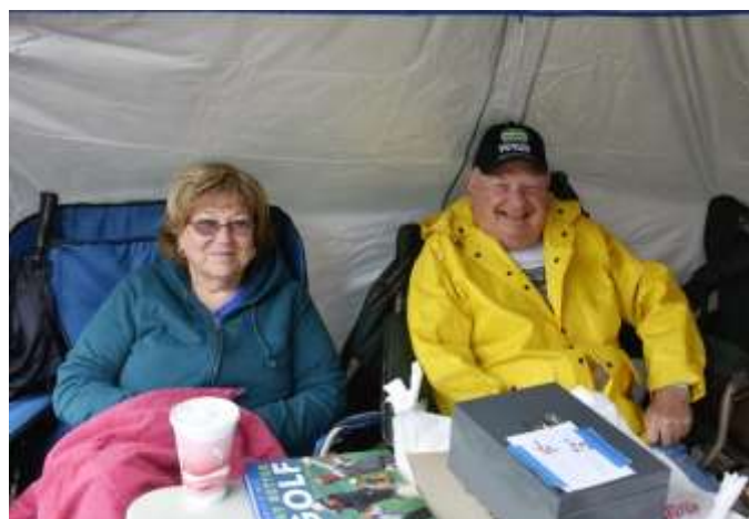
The Kapral's smiling in spite of the circumstances!