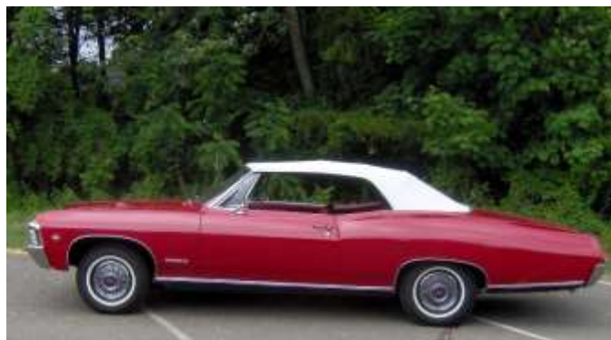
1967 Chevy Impala SS convertible

Lead from Dave Cavagnaro djcav@ptd.net Home 908-362-5775