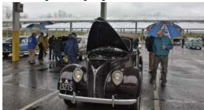
The judging team at work!