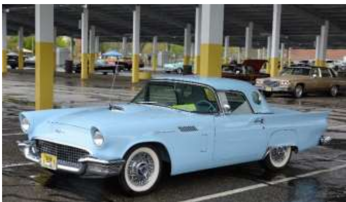
1 st Place – Paul Semmler's 1957 T-Bird