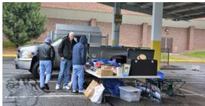
The other vendor who braved the weather