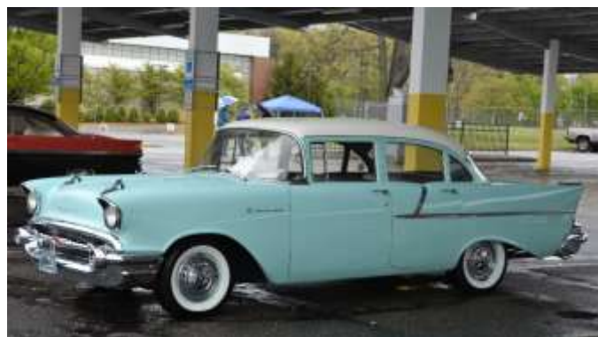
2 nd Place – Pete Cullen's 1957 Chevrolet