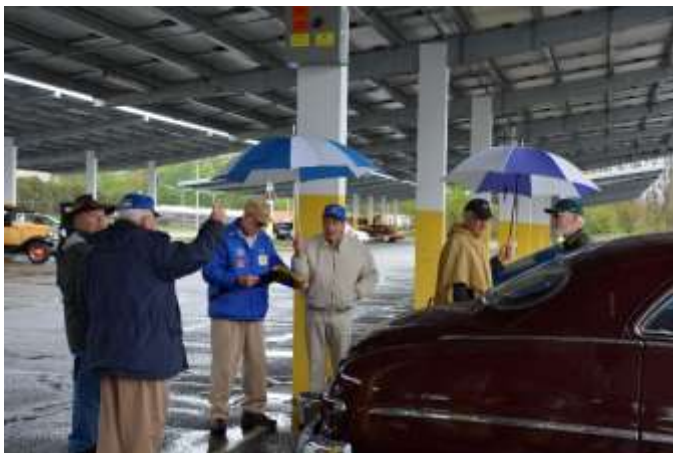
The judging team at work!