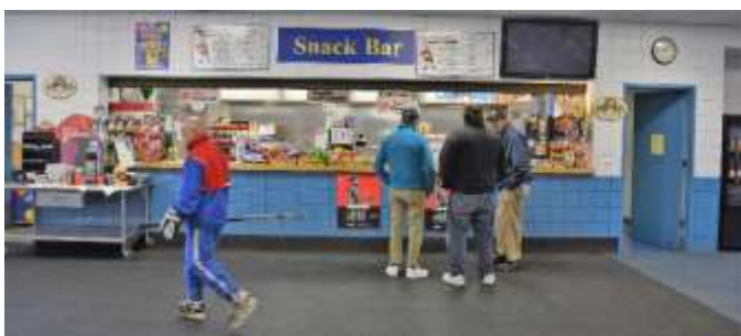
The Mennen Arena Snack Bar