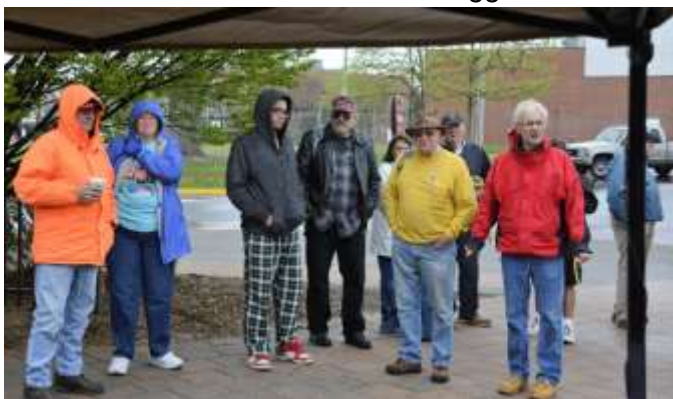
Attendees waiting for the winner announcements.