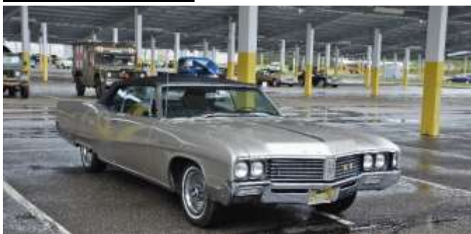
Duffy Bell's Buick