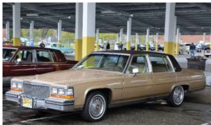
2 nd Place – Ray Griffel's 1991 Cadillac

Open Road Cadillac of Morristown 334 Columbia Turnpike Florham Park, NJ 07972 Spring Meet Sponsor