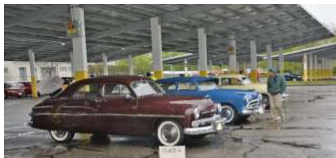
The cars of Class 4