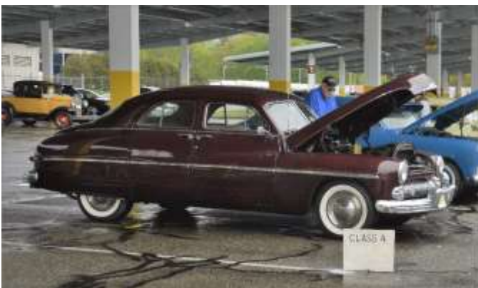
2 nd Place – Ron Hutchin's 1950 Mercury