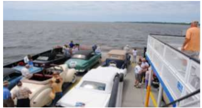
Tourists enjoying a ferry ride on the 2011 SE Divisional Tour!