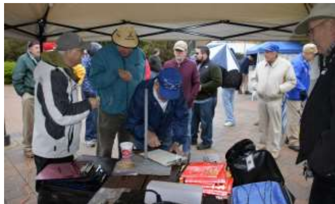
Judges signing up to judge.