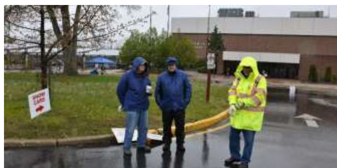
The parking team wondering if any cars will show.