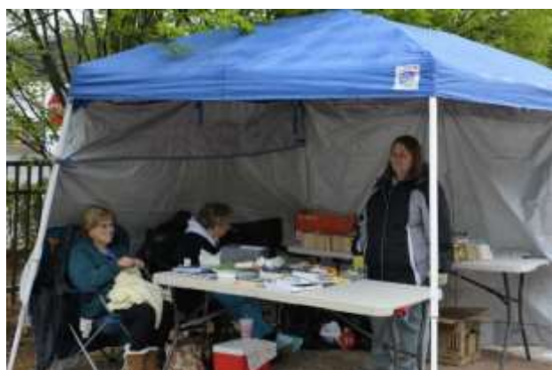
The book sale ladies trying to keep dry