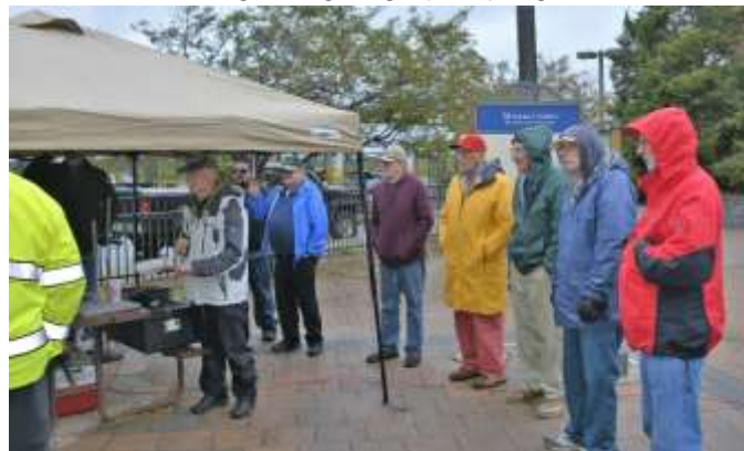
Chief Judge Geller giving last minute instructions.