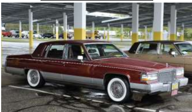
1 st Place – Roger Bagley's 1987 Cadillac