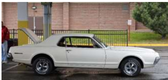
1 st Place – "Suds" Reddy's 1967 Cougar