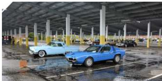
A virtually empty show field!