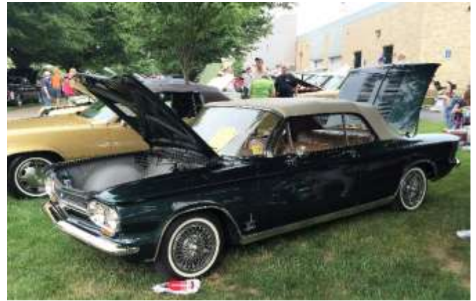
A very nice Corvair Convertible