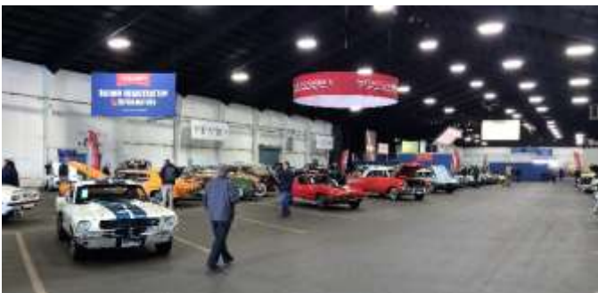
More of the cars up for auction on the inspection floor