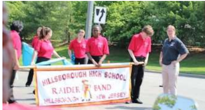
The Hillsborough High School Raider Band was just as anxious to get going as we were!