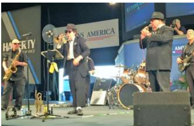
Blues Brothers Tribute Band performing