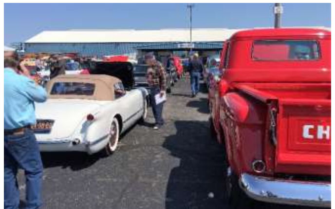
Cars lined up outside to go to the auction block