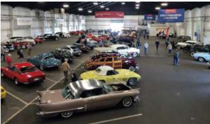
Cars up for auction on the inspection floor