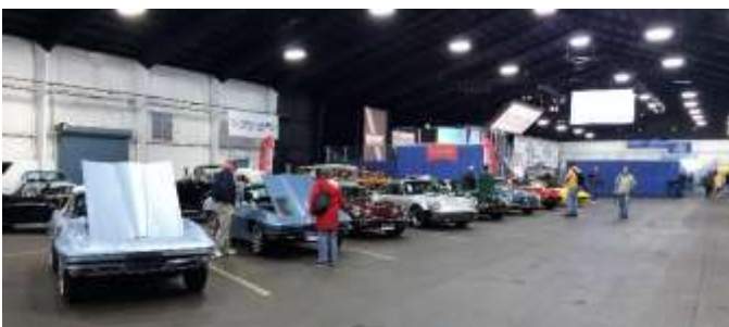
The inspection floor was in several buildings