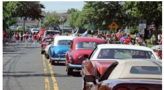
Our cars, Hillsborough residents!