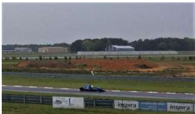
Another car practicing in the rain on the track