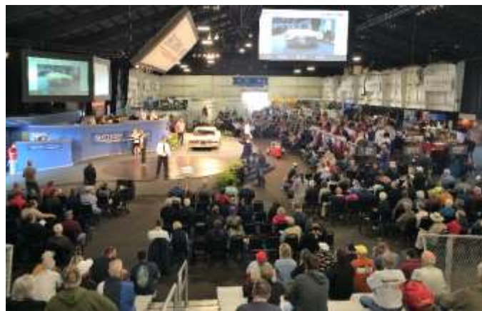
The auction in progress

On Saturday, AACA cars assembled on the show field for display and to be judged.