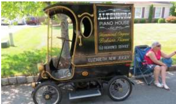
Bette Pritchett staying in the shade!