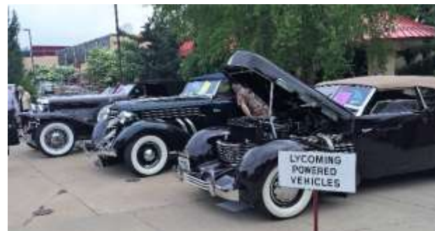
3 vehicles powered by Lycoming engines