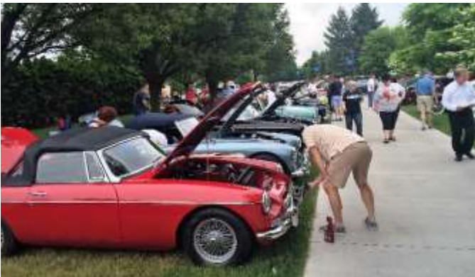
I never saw more MG's in one spot!