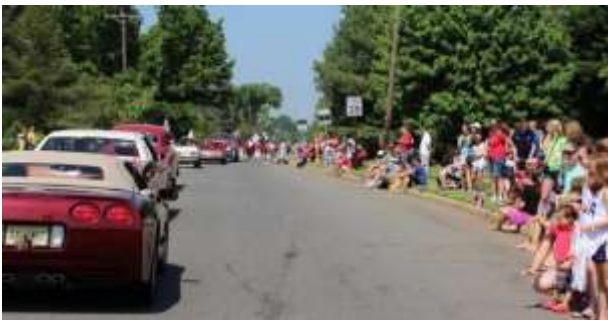
Hillsborough residents enjoying our cars.