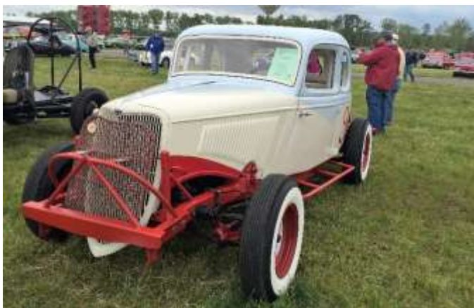
Norm Hutton's #3 Stock car