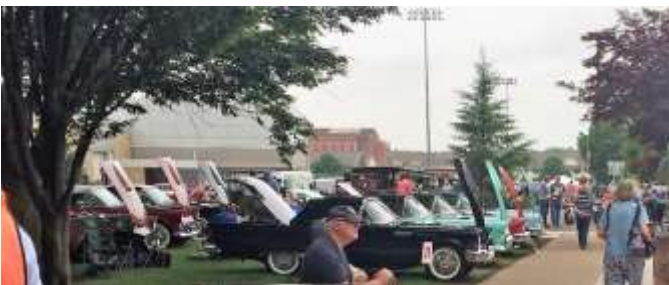
Or '55 – '57 Thunderbirds! The Road Map – July 2016