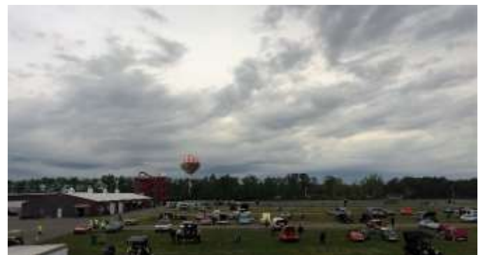
The show field. Note the sky!

Kudos to the South Jersey Region AACA. In spite of the lousy weather, they worked hard and created a great event!