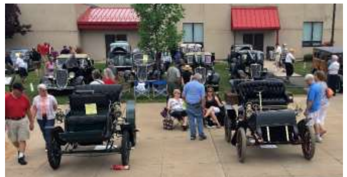
A couple Class 09A cars

New Jersey Region Web Site www.njaaca.org