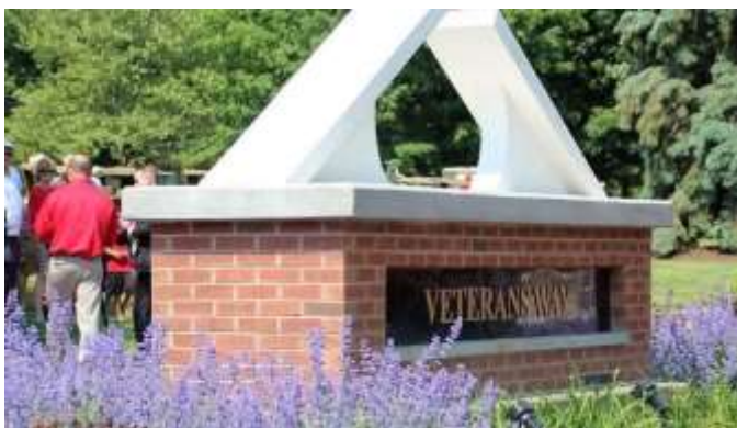
The parade ended at Veteran's Way, which leads into the Hillsborough town hall.