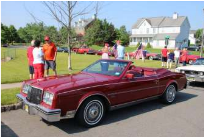
Members commiserating while waiting for the signal from the starter to start your engines