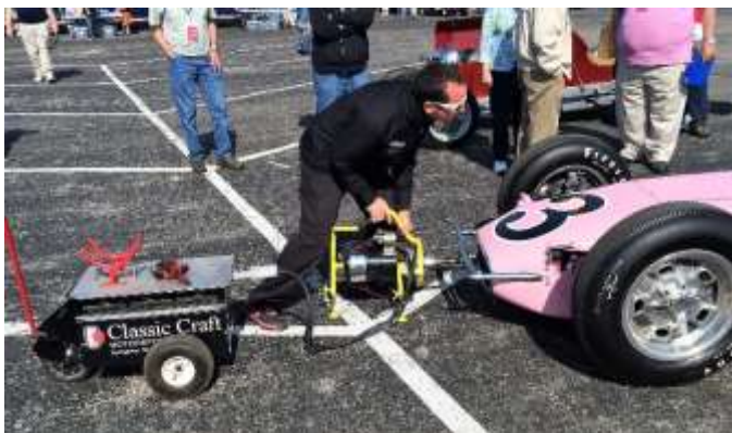
Starting Indy car #3 during qualification run