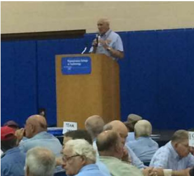
Chief Judge Alfred Reeves giving instructions