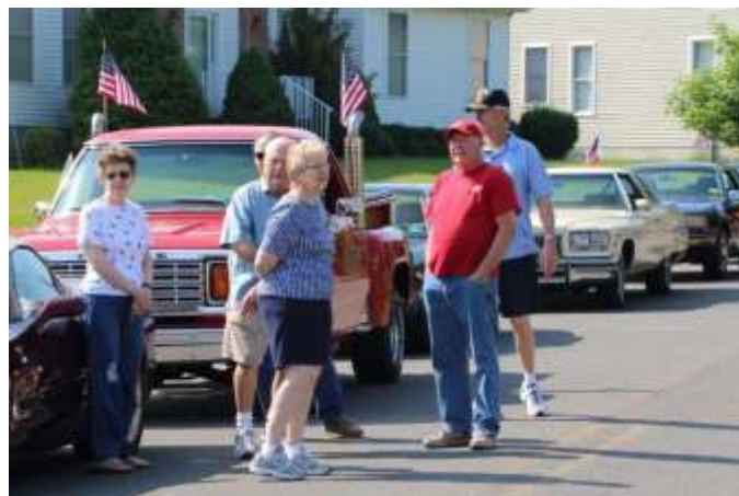
This is what we do when we're ready to go.