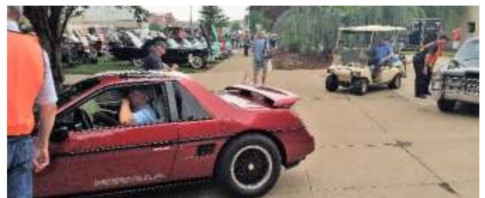
A couple more late comers making their way to their spots on the show field

New Jersey Region Web Site www.njaaca.org