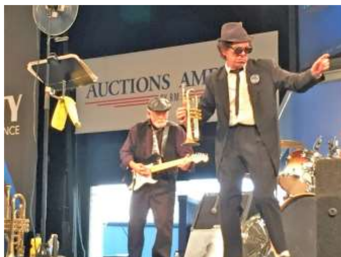
Blues Brothers Tribute Band performing