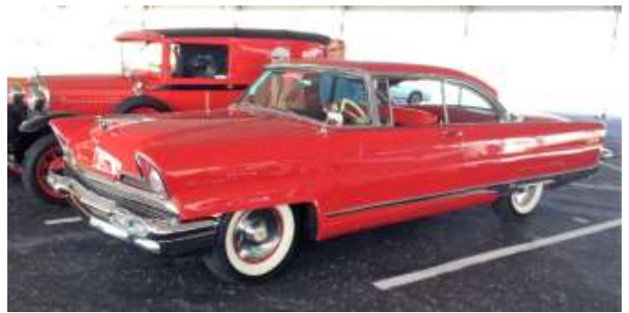
1956 Lincoln Premiere up for auction