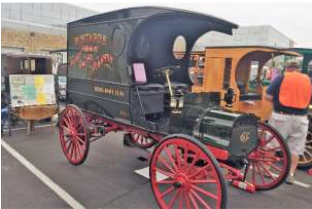
Charles Bustard's 1909 Chase solid tired truck