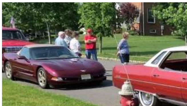
We're not. We are enjoying the comraderies!