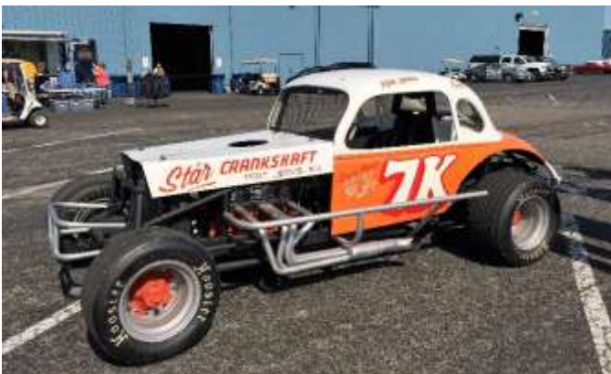
Norm Hutton's 7K stock car