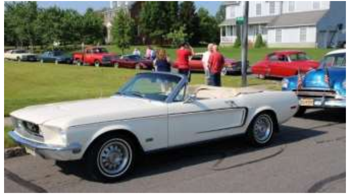
Cars are staged, members waiting to roll.