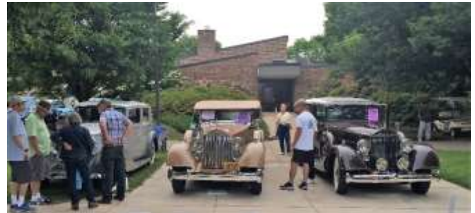
A couple very nice Packards