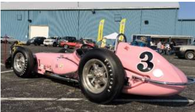
#3 Indy car