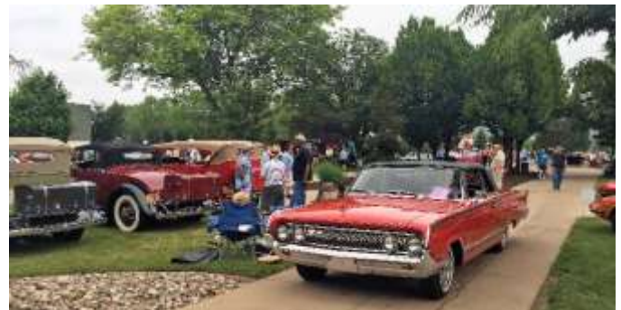
A late comer trying to get to his location