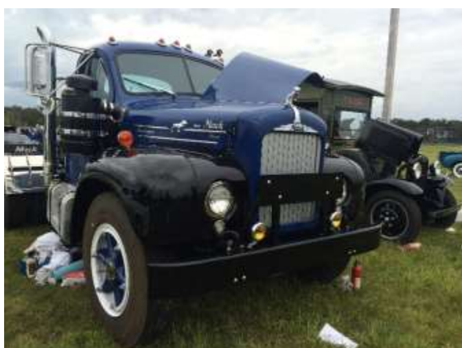
A fully restored Mack tractor on the show field