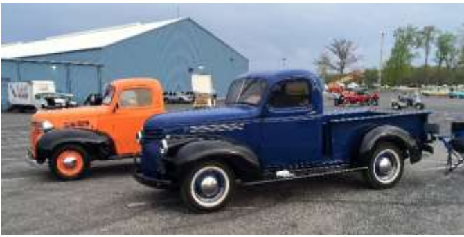
A couple pick-up trucks on the show field