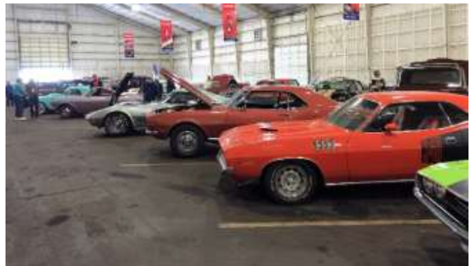
Another building with cars to be auctioned.