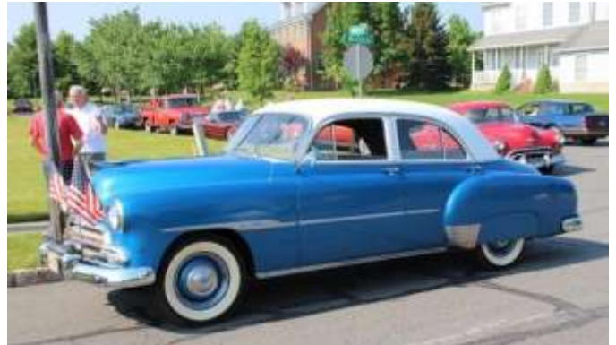
Frank Figorotta's '52 Chevy in the staging area