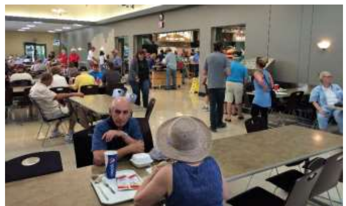
The college café ran out of hot dogs! New Jersey Region Web Site www.njaaca.org