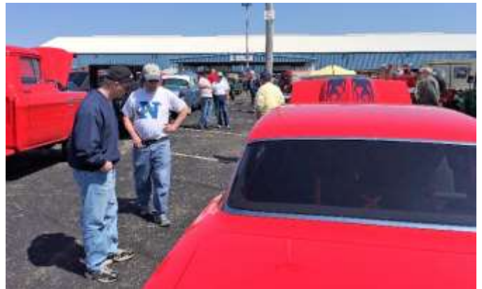
Cars lined up outside to go to the auction block