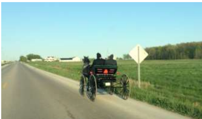
Amish on their way to a horse auction