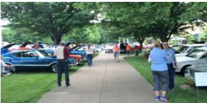
Typical of the layout for this show