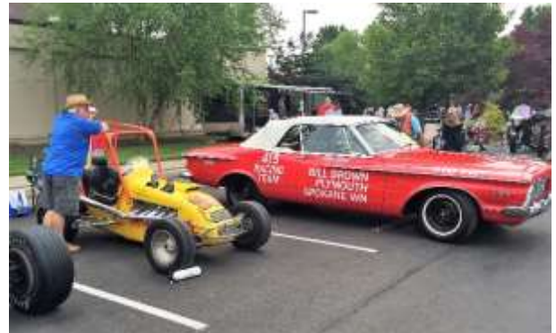
D W Ackerman's 1962 Plymouth Dragster