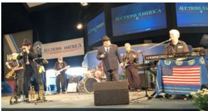
Blues Brothers Tribute Band performing