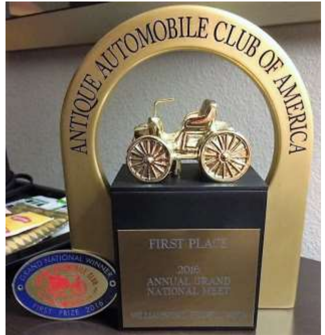
And this, folks, is what it is all about!