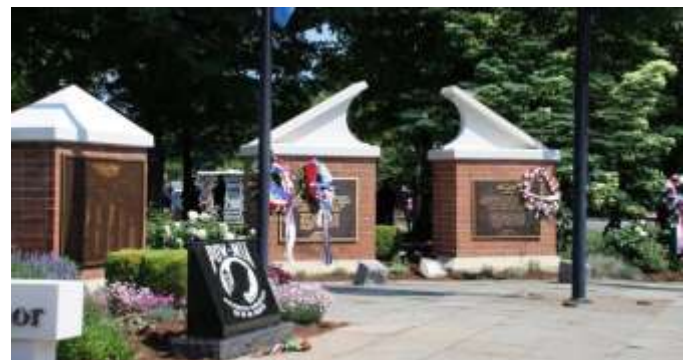
Hillsborough Veteran's Memorial Park a fitting ending for a Memorial Day Parade!