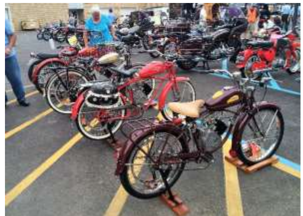
Class 05D, mostly Wizzer motorbikes