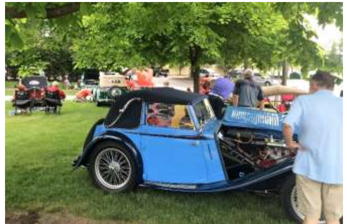
1933 MG J2 of Reed Tarwater