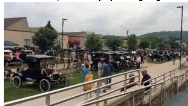
Rows of Model T Fords The Road Map –July 2016