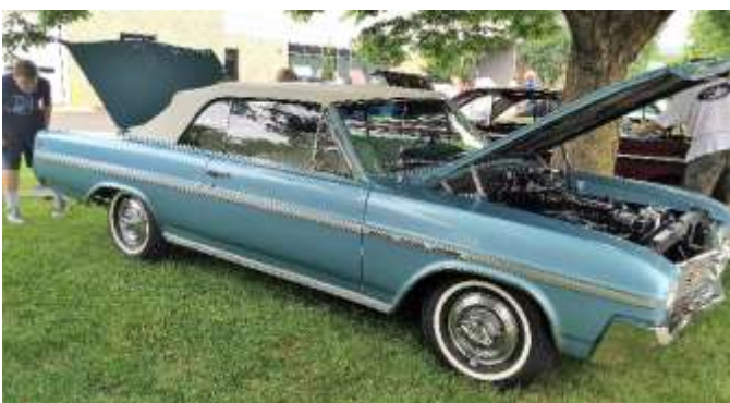
1965 Buick Skylark