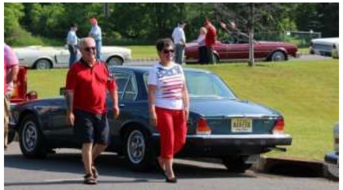
The Bagley's are having a good time!