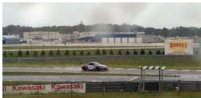
A sports car practicing in the rain on the track. There were a number of cars that race in adverse conditions practicing on the track.