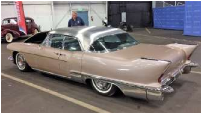
'58 Cadillac with air ride suspension up for auction on the inspection floor