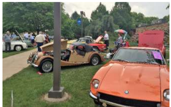
Sports cars preparing to be judged