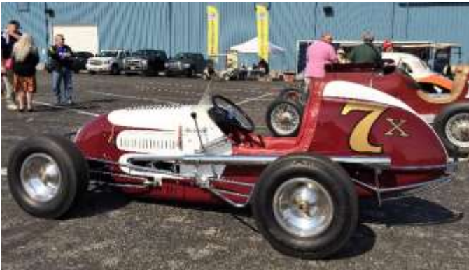
Ford V-8 60 powered Midget race car