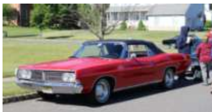
Harvey Frumkin's '68 Ford Galaxie 500