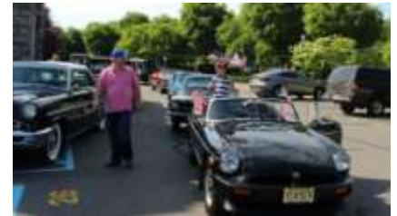
Staged & ready to go