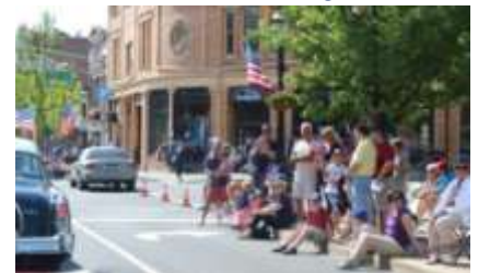
Both sides of Main Street were lined with spectators