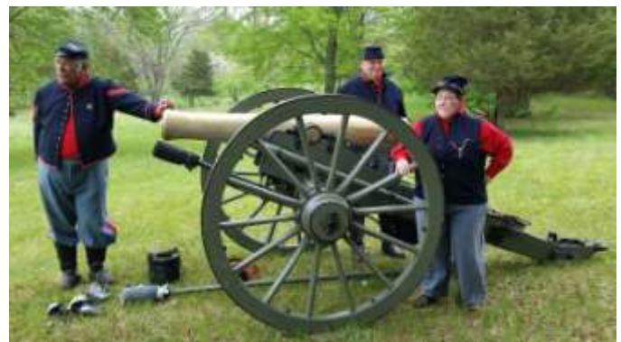
Civil War reenactment