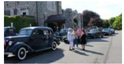
The line up