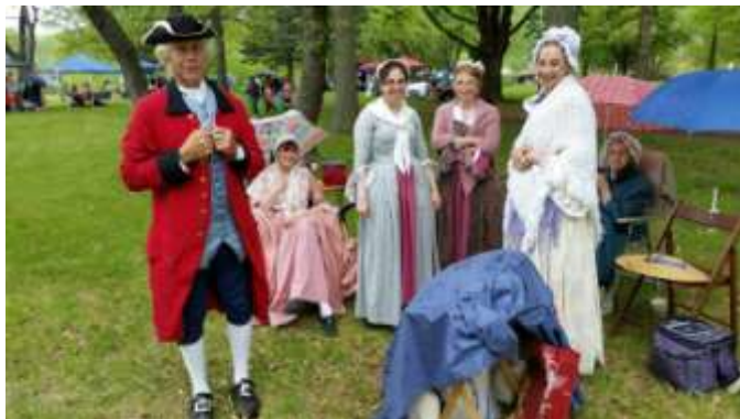
Historical clothing display