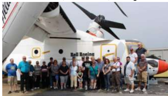
Attendees at the American Helicopter Museum

New Jersey Region Web Site www.njaaca.org