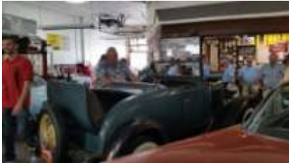
Tourists enjoying the shop