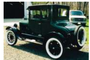
1926 Ford Model T Coupe