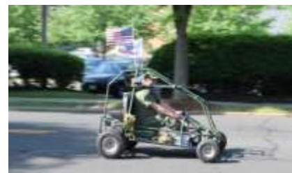
A small participant