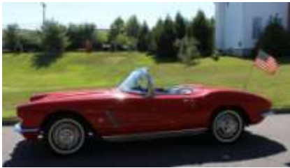
A guest's C2 Corvette