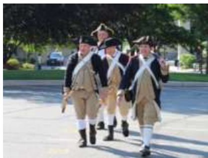
Colors preparing for the parade