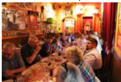
The group at the closing dinner