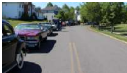
And the rest of the cars

Even the Hillsborough Fire Department was ready to go