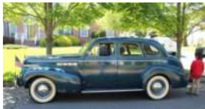
Roger & Kathy Bagley's '40 Buick (with a young spectator checking it out)

All participants arrived well ahead of time and we were staged ready to go;