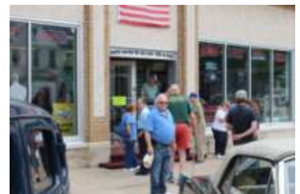
Tourists hanging out in front of the Wheels In Motion shop