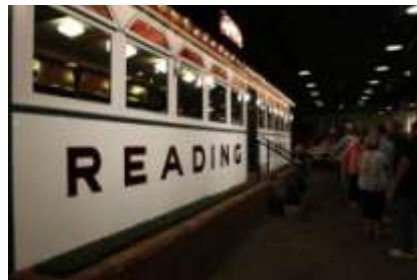
The diner in the museum