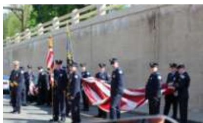
Madison Fire Department. What would a parade be without the fire department!