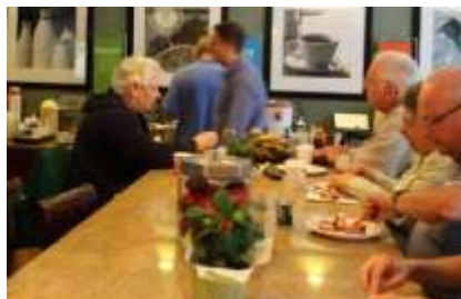
Lunchtime between QVC and Wyeth's