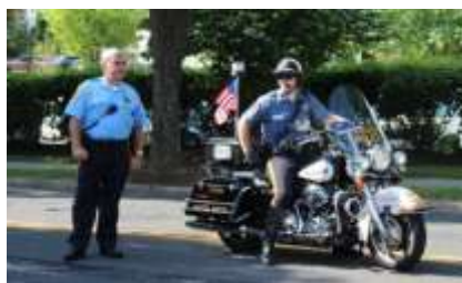
The Madison Police participated