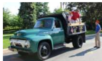
A local "float"