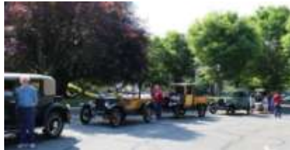
Lined up & waiting (to the rear)