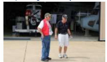
The American Helicopter Museum Tour Guides