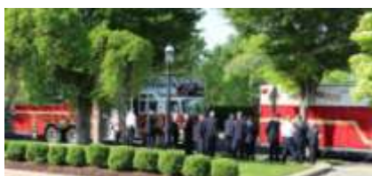
Madison Fire Dept.