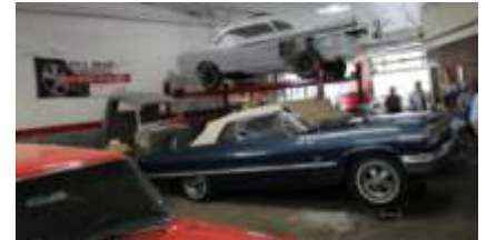
More cars being worked on