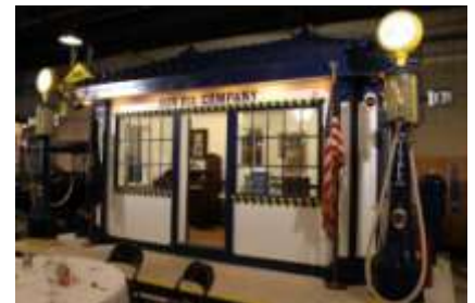
Vintage Sun Oil Co. station