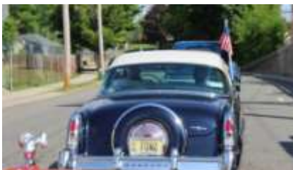
The parade is underway