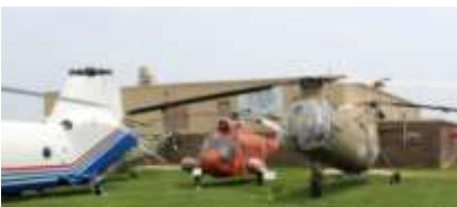
Outside display at the American Helicopter Museum