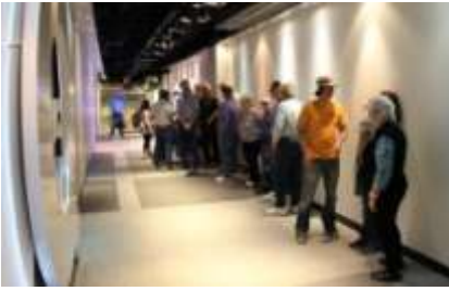
Lined up to get into QVC