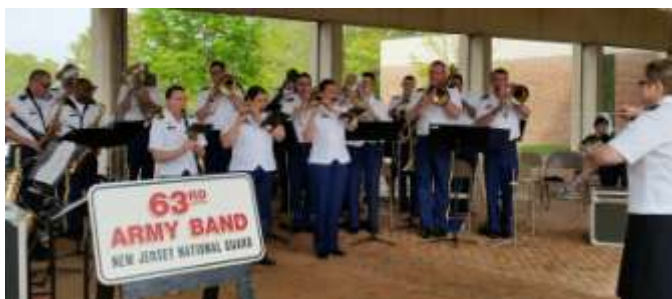
NJ National Guard 63 rd Army Band