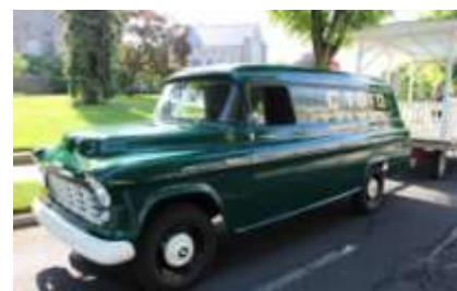
A float tow vehicle