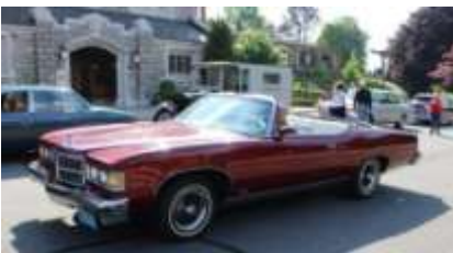
Marc Bernstein's '75 Pontiac