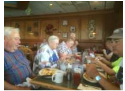
NJ Region Wheels In Motion tourists at the Readington Diner