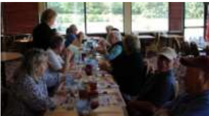
Lunchtime between QVC and Wyeth's