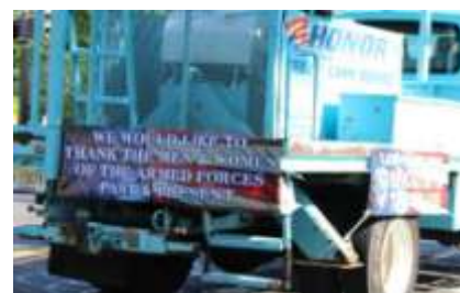
One of the floats