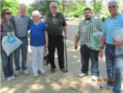
Tourists with their QVC purchases