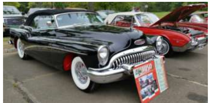
Vintage Automobile Museum Display