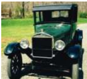
1926 Ford Model T Coupe