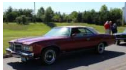
Marc Bernstein's '75 Pontiac