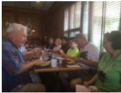
NJ Region Wheels In Motion tourists at the Readington Diner