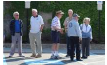
Early arrivals keeping track of later arrivals