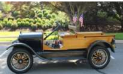
Kirk Judkin's '26 Ford Express Wagon