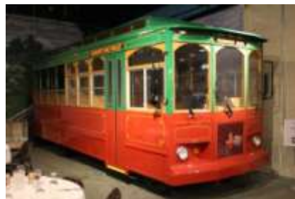
A trolley in the museum