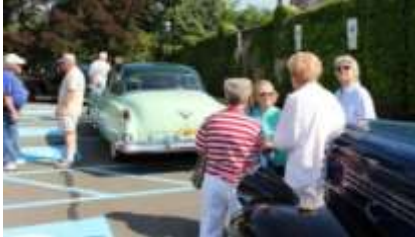
Cars are staged and members are commiserating