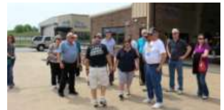
The group with a tour guide