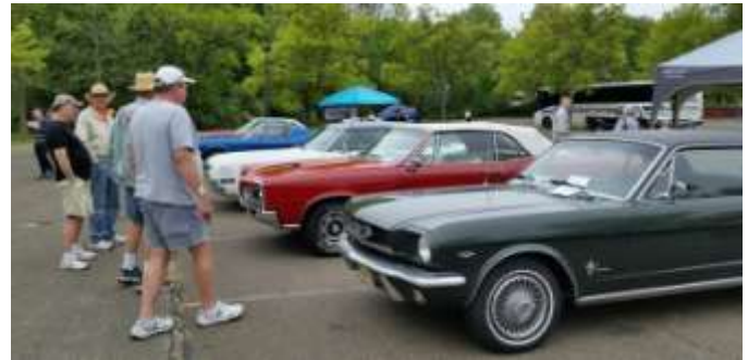
Left to right, 1976 Cadillac, 1968 Ford, 1966 Oldsmobile, 1966 Pontiac, 1966 Ford