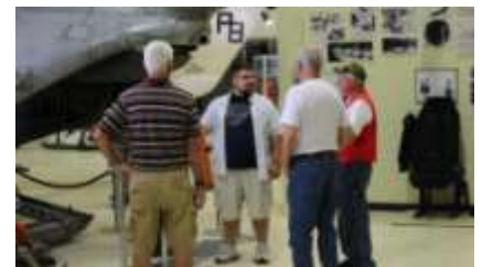
Tourists discussing a helicopter with a tour guide