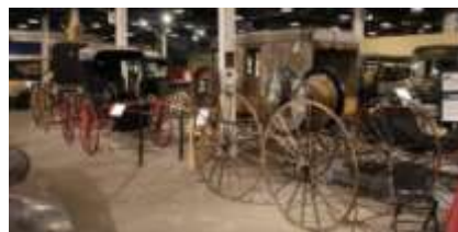
A line up of buggies