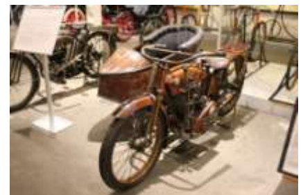
A vintage motorcycle with a sidecar

New Jersey Region Web Site www.njaaca.org