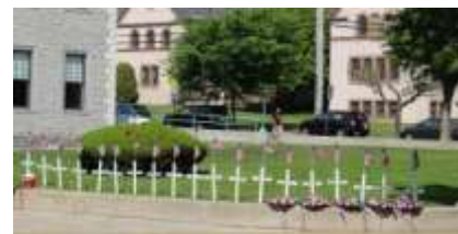
Memorial to Madison military who gave their lives