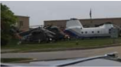
Approaching the American Helicopter Museum