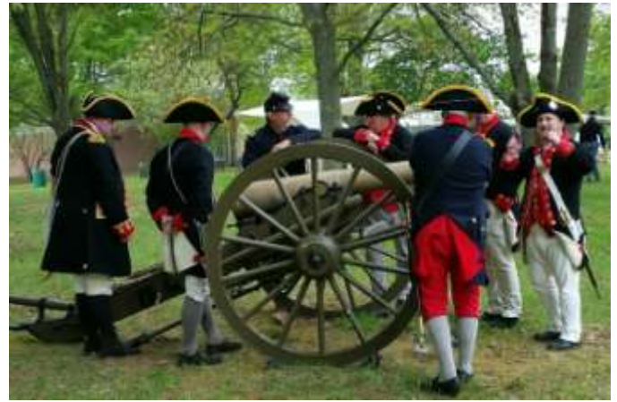
Civil War reenactment