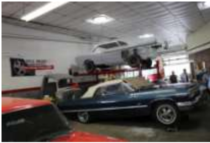
Cars in Wheels In Motion shop being worked on