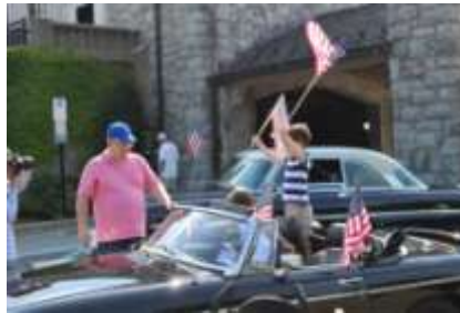
What's a parade without kids?