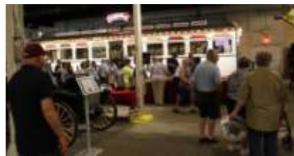
Lunch in the museum