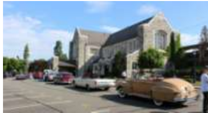
Lined up & waiting (forward)