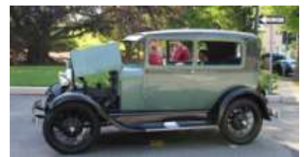
A guest's Model A Ford