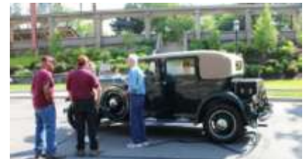
A guest discussing his car with a couple spectators