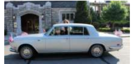
Peter Hinge's '72 Rolls Royce