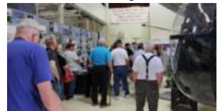
Tourists listening to the guide explaining what they will see