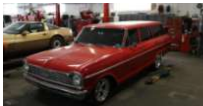
Cars in Wheels In Motion shop being worked on