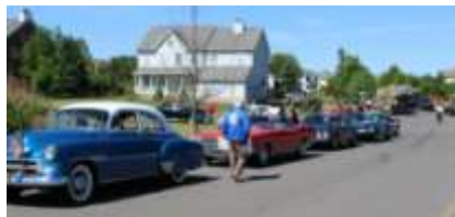
The front of the line

All participants arrived well ahead of time and we were staged ready to go;