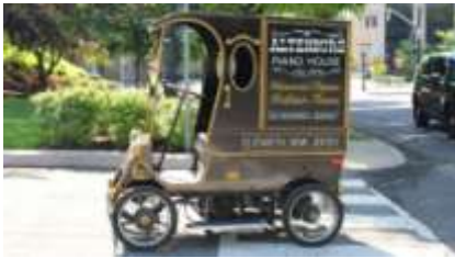
Art Briggs' replica 1902 Cadillac