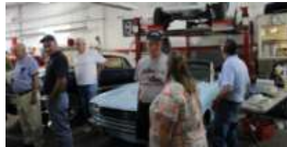
Discussions in the shop!