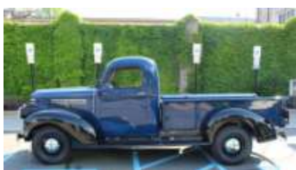
Tim Schimmel's '46 Chevy