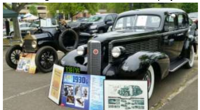
Vintage Automobile Museum Display