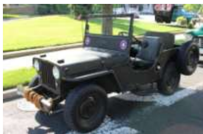
Vintage Military contingent