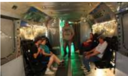
The passenger compartment of a helicopter on display