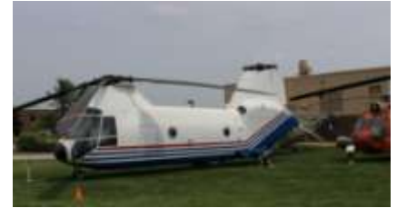
Helicopters displayed outside