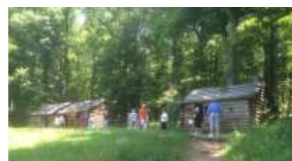
Group touring reconstructed officer's huts at the encampment