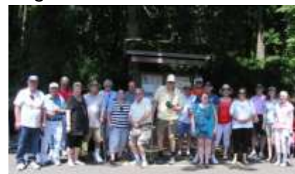
Tour group before hiking up the hill to the encampment