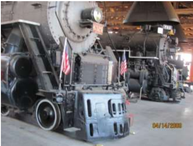
Some of the steam engines on display at the Age of Steam Roundhouse