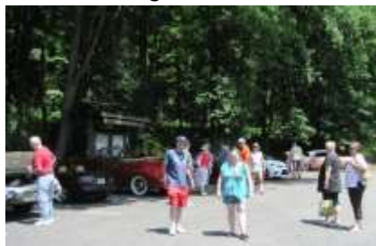
Tourists preparing to view the Jockey Hollow encampment