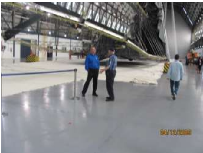
Tourists inside the Goodyear Airship Hanger Dock where a new blimp is under construction