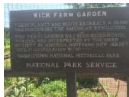
A brief explanation of the gardens at the Wick Farm