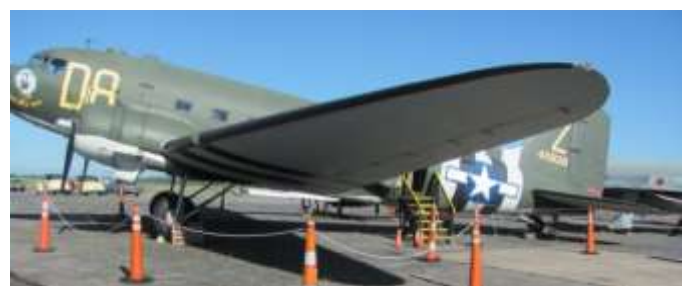
Planes on display at the MAPS Military Aviation Museum