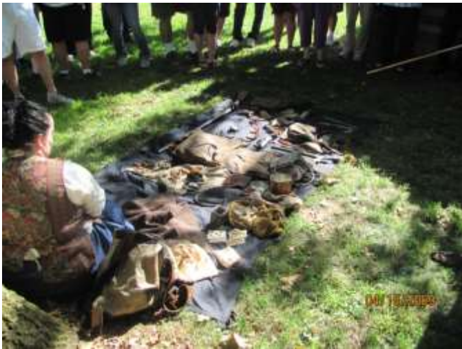
A display of a Revolutionary War soldier's field kit