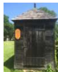
The smokehouse on the Wick Farm