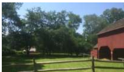
View of the Wick Farm