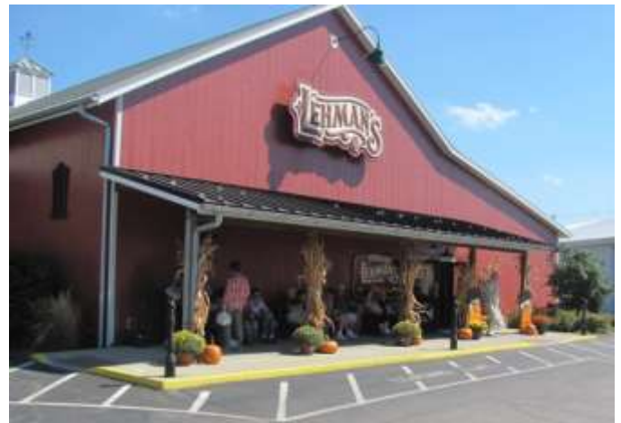
Touring the famous Lehman's Hardware Store in Kidron, Ohio