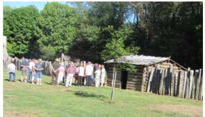
Tourists at Schoenbrunn Village