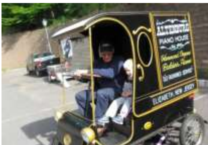
The Altenburgmobile arrives