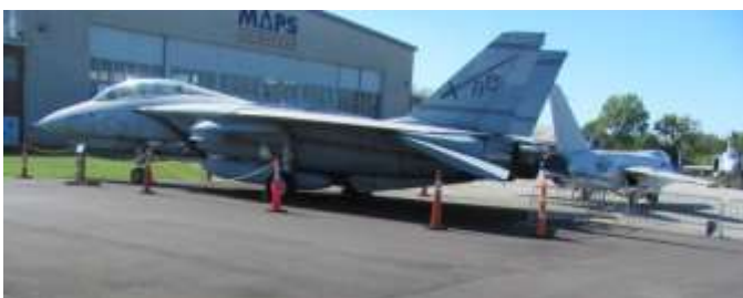
Planes on display at the MAPS Military Aviation Museum