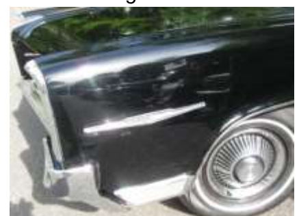
'64 Bonneville, life doesn't get better than this