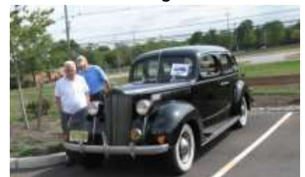
Packard inspection time