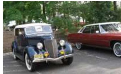
A Ford lover's dream