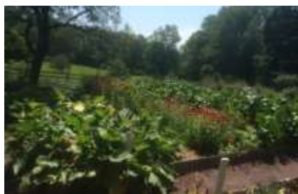
The period garden at the Wick Farm