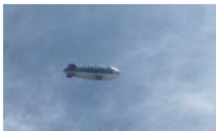
Met Life Blimp covering our tour