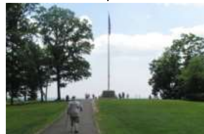
Washington Rock monument