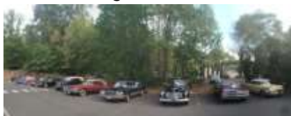
A panoramic view of the cars