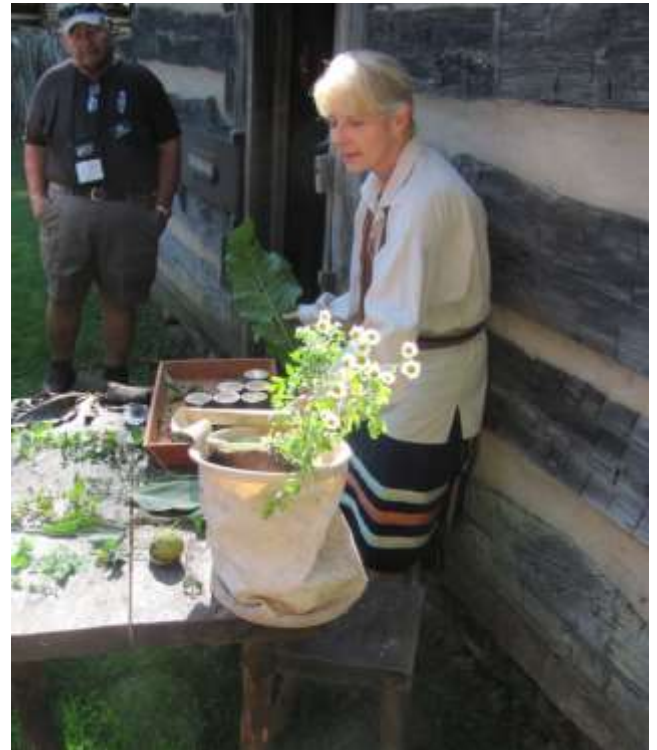
A garden display of what people living in the village might have planted in their gardens

Editor's note: Thank you, Duffy Bell, for taking these pictures, writing the captions for them and writing this article for the Road Map!