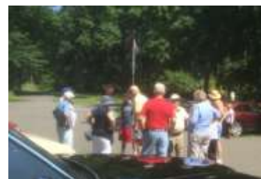
Starting at the Tour