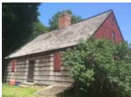
The Wick House