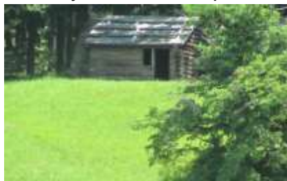
A restored officer's cabin at the Jockey Hollow encampment