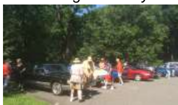
Arrived at the Jockey Hollow Visitor's Center