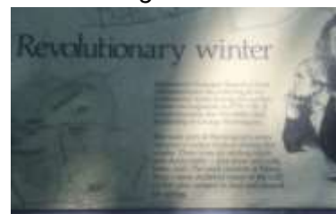
What Jockey Hollow's about