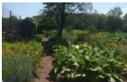
Another view of the Wick Farm garden