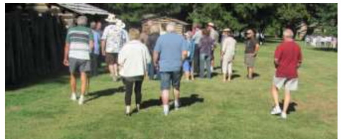
Tourists at Schoenbrunn Village