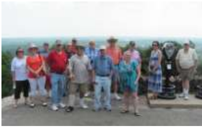
Part of the tour group at Washington Rock