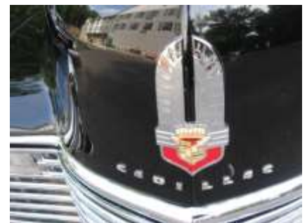
It is just dramatic