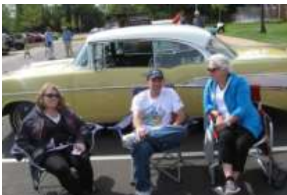
Pritchett group poses in front of Pritchettmobile