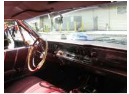
Dashboard, not dashbored