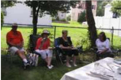
Time to eat and relax!