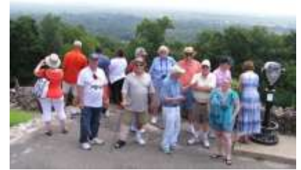
Part of the tour group at Washington Rock