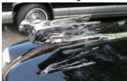
A Cadillac lover's hood ornament