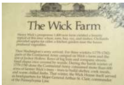
The role of the Wick farm