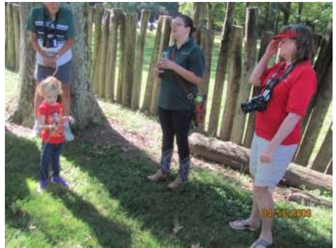
Tourists at Schoenbrunn Village