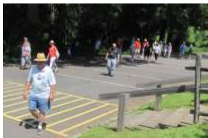
We all did some walking on this tour!