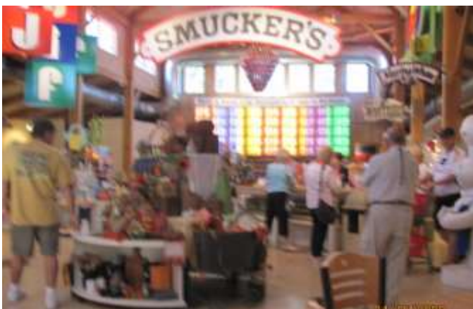
Inside the Smucker's Company Store, also in Kidron, Ohio