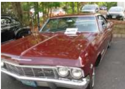
A Ford Lover's Chevy