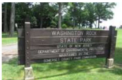
Sign inviting you to the view from Washington Rock