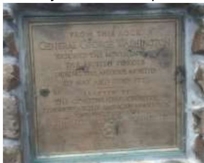
Plaque on the Washington Monument