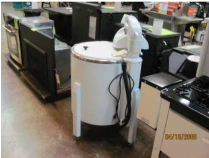
Touring the famous Lehman's Hardware Store in Kidron, Ohio