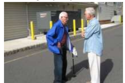
A meeting of the minds