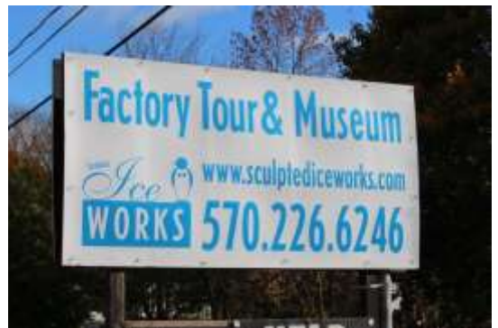
Sign at the Sculpted Ice Works