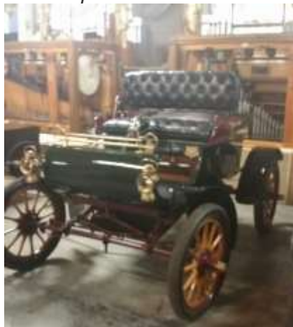
Curved Dash Olds?