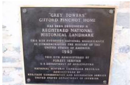
Grey Towers Historic Landmark plaque