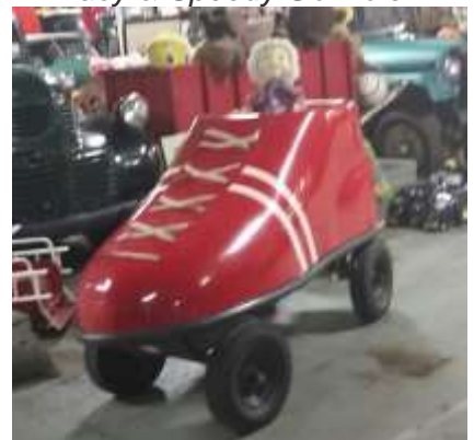
If you think it didn't exist, here it is!