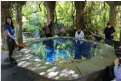
Dining Pond at Grey Towers. Diners sit around the pond and food is "floated" across the table.