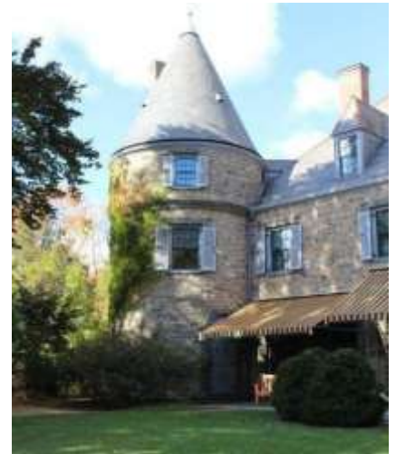
A turret at Grey Towers