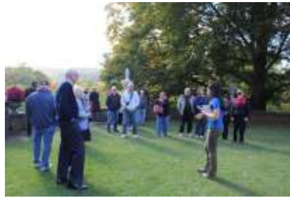
Tourists listening to their Grey Towers tour guide