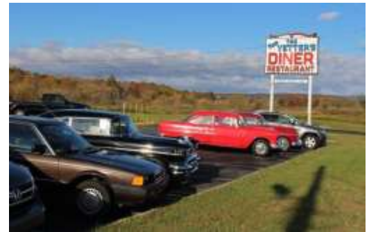
Tourists chariots ready to start the tour