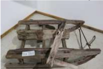
Remnants of an ice sled at the Sculpted Ice Works and Ice Harvest Museum