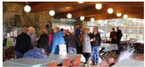
Tourists gather for "Wine & Cheese" in Lukans Recreation Hall

That's the way we all became the Lukan's Bunch