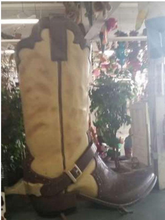
We got a "kick" out of this boot!