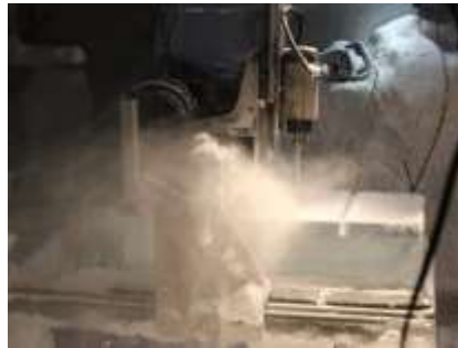
CNC machine cutting the rough form for the ice sculpture