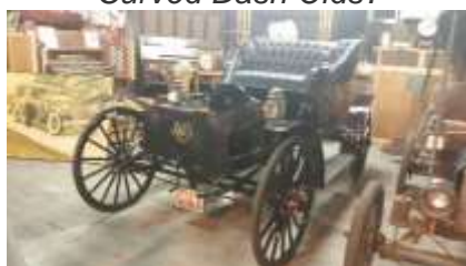
ABC car on display. I bet Herb would know what it is!