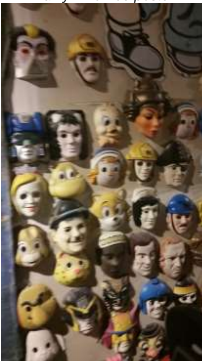
Lets face it, they have a lot of masks!