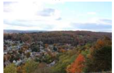
Overlook from the train on tour