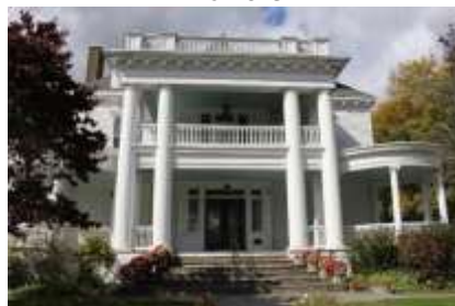
The front of The Columns