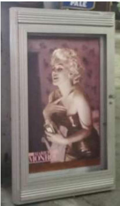
Marilyn Monroe poster