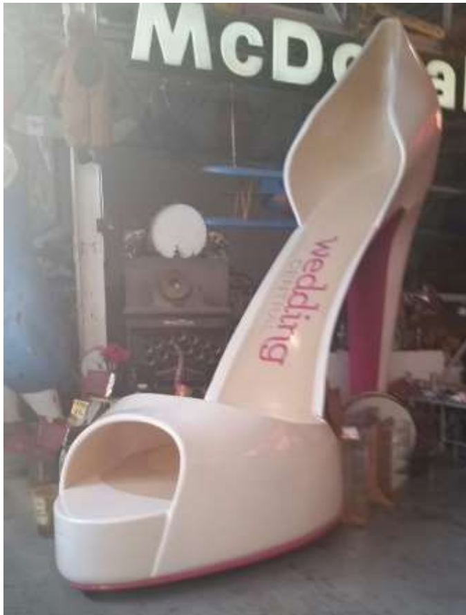
Tonight, we have really big shoe!