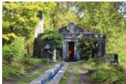
"The Bait Box" playhouse at Grey Towers