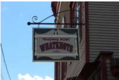
A local store sign