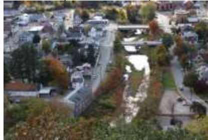
A scenic view from the train tour