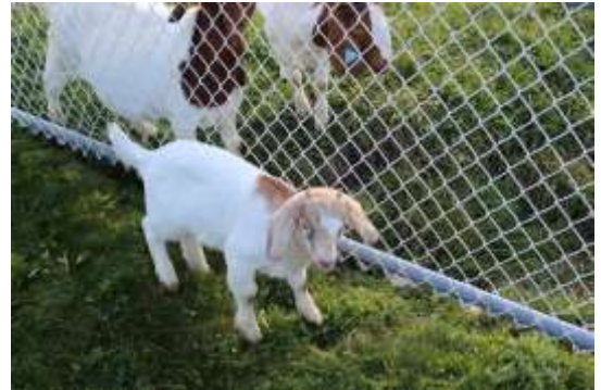
One of the permanent residents at Lukans