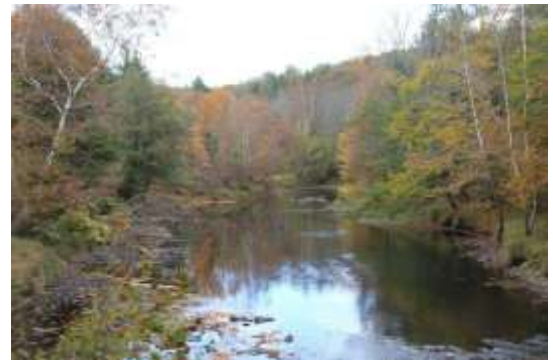
Scenic area river