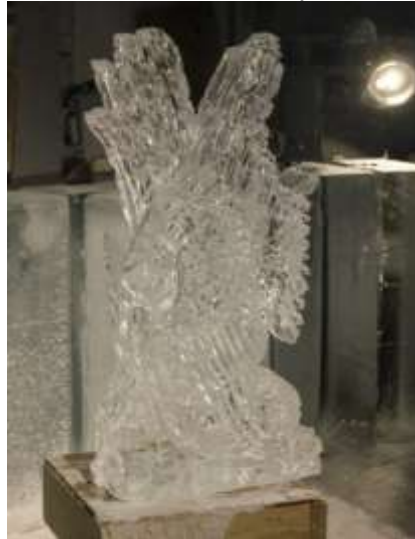
Completed ice sculpture