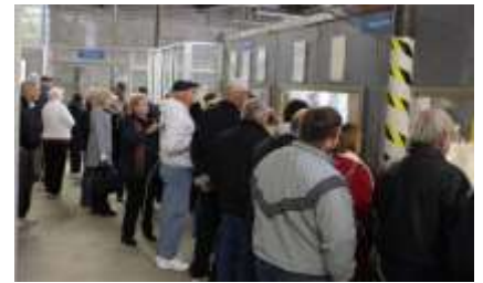
Tourists watching the ice sculpting