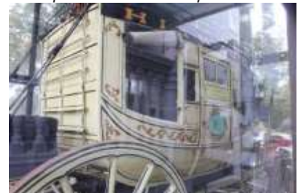
"Carriage Under Glass" at The Columns