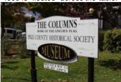
The Columns museum