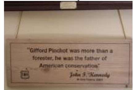
Gifford Pinchot was the original occupant of Grey Towers. The grounds & buildings were donated to the U.S. Dept. of Agriculture; Forest Service