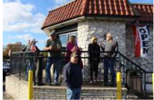
Tourists starting the tour at Yetter's Diner

On Saturday after breakfast, we took another short scenic ride to the north side of Lake Wallenpaupack to the Ice Harvesting Museum, where there were fascinating exhibits of where the ice for your parents (or grandparents) ice box came from – all year long! A special treat was watching the ice sculpture artists at work, preparing customer ice displays for delivery to many NJ area catering halls. Hurry, we had to get back to Lukans for the famed Thanksgiving Lunch – roasted turkey with ALL the fixin's ready for us to savor.