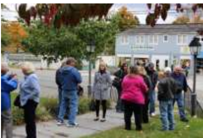
Tourists awaiting the absent docent at The Columns. We never did go inside.