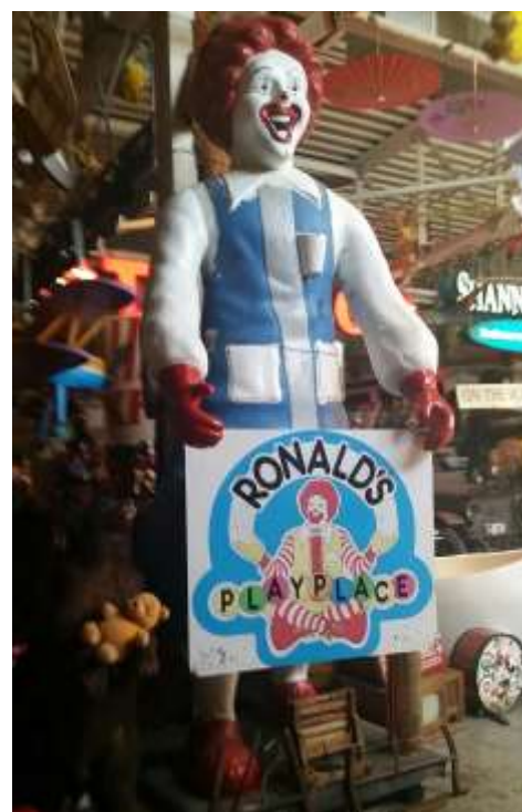
Ronald McDonald store display