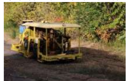
A track repair machine seen along the train tour