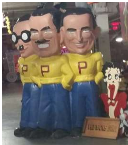
The Pep Boys, Manny, Moe & Jack