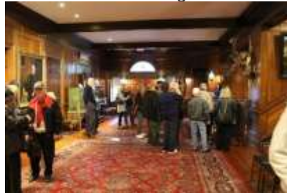
Tourists in the parlor of Grey Towers