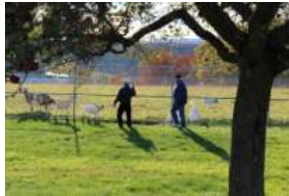
Tourists greeting the "residents" at Lukans Farm Resort