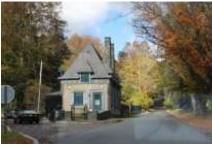
The gate house at Grey Towers Historic site in Milford, PA