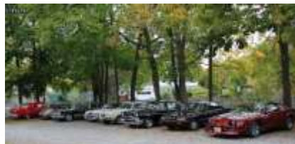
Tourist's vehicles at The Columns