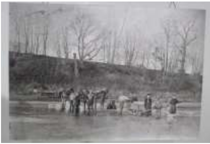
Old photo of ice harvesting