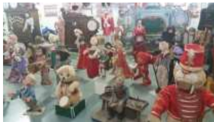
Antique doll collection