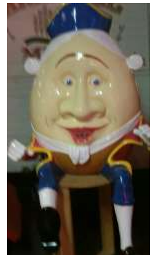
Humpty Dumpty store display