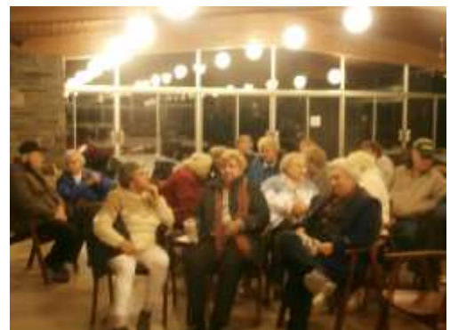
Saturday after dinner at the Lukans Recreation Hall