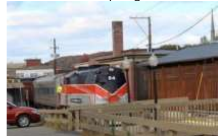
The "Stourbridge Line" train arriving at the station for our tour