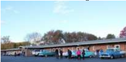
Tourists arriving at Lukans Farm Resort