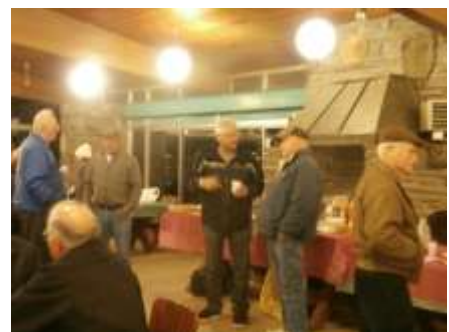
Serious discussion in the Lukans Recreation Hall. Spring meet?