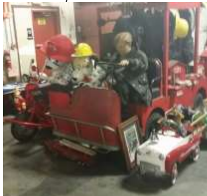
Fire Department to the rescue