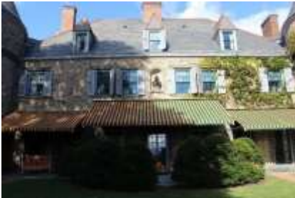
An exterior view of Grey Towers