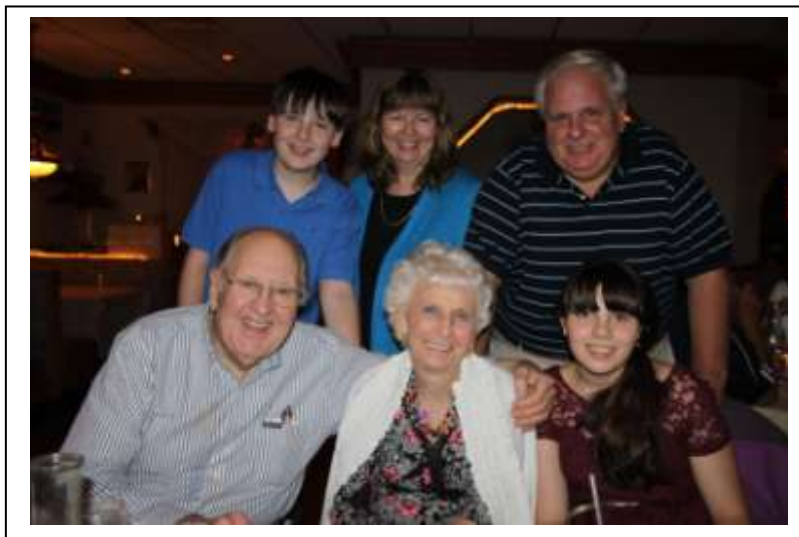
The Singe Family