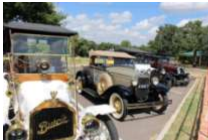
They weren't all Fords