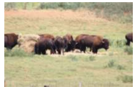
Oh give me a home where the buffalo roam...