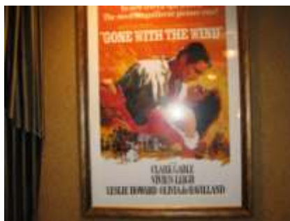
Gone With the Wind. Certainly not here.