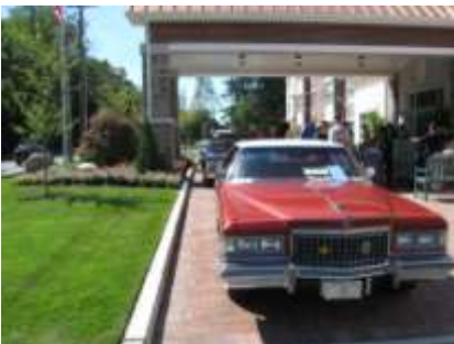
"Rosie" looks resplendent awaiting review at Mahwah