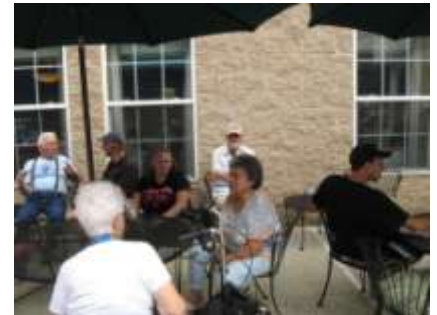
A rare moment: No one eating!