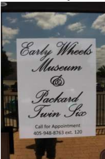
Early Wheels Museum