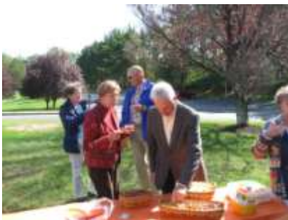
The wine & cheese table