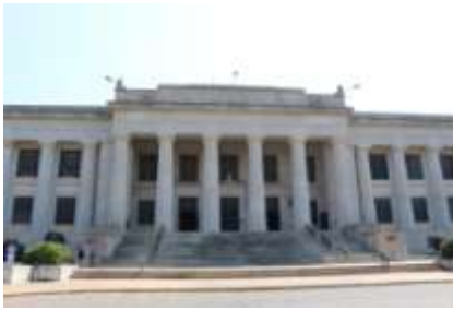
Scottish Rite Masonic Temple in Guthrie