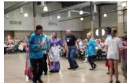
This is not the Hokey Pokey!