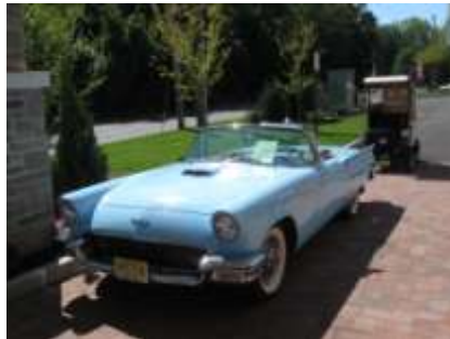
Isn't this the nicest '57 Bird you've ever seen?