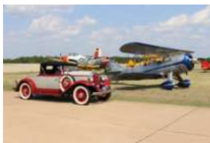
Need I say more...