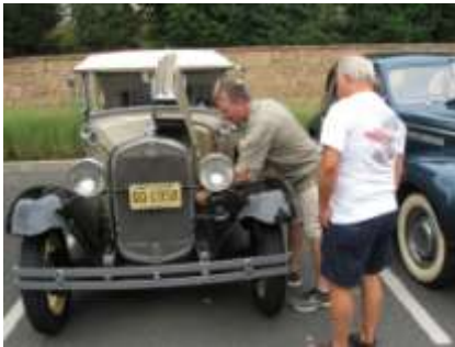
How to fix a Model A in 3 easy lessons.