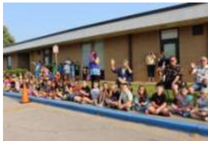
School kids greeting the tour cars