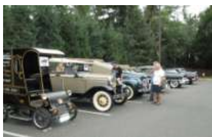
Cars lined up, ready for the residents