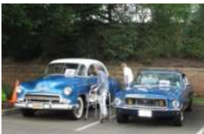
Residents admiring the Figorotta's '51 Chevy