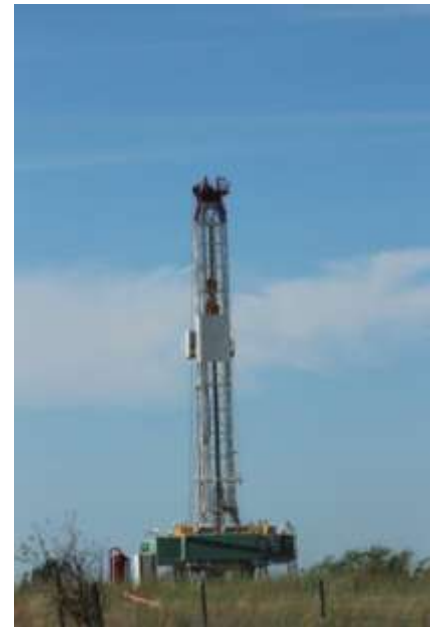
There's oil in them thar hills