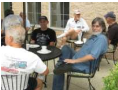
Region members discussing their cars (What else?)