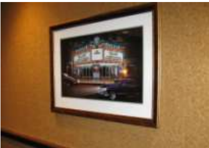
An iconic marquee