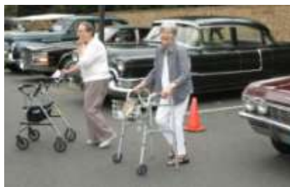
Residents admiring our cars