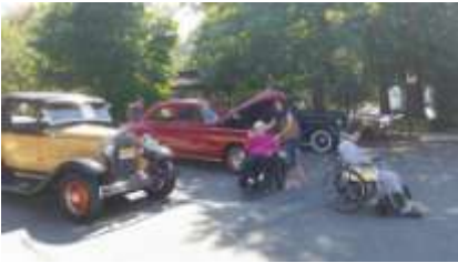
1930 Ford, 1930 Oldsmobile, 1936 Ford