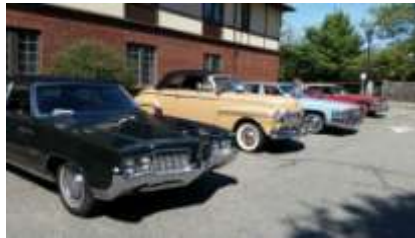
L to R, 69 Oldsmobile, 46 Mercury, 77 Cadillac, 92 Mercedes, 76 Cadillac