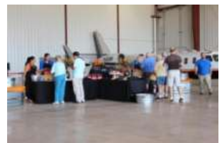
Root beer floats at the Sundance Airport