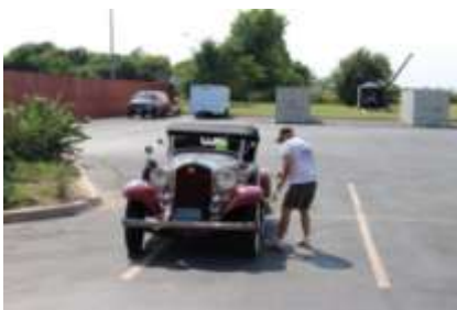
Getting ready for touring