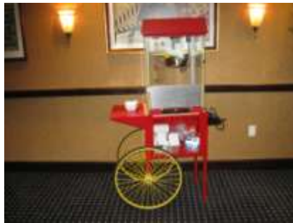
One of the accouterments of the Charlie Chaplin theater. Anyone for popcorn?