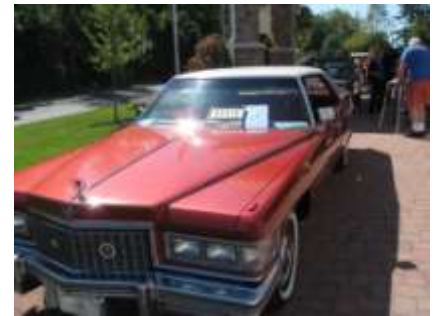
"Rosie" brings pleasure where ever she goes!