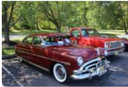
2 nd Place: Wayne Tuck