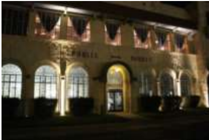
Home of the Freshmen dinner and closing banquet