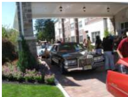
Its given name is "Clair de Lune." It enjoys sitting in shadows