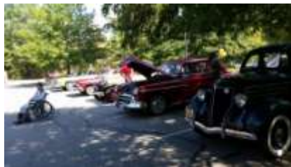
L to R 74 Cadillac, 65 Chevrolet, 30 Ford, 50 Oldsmobile, 36 Ford