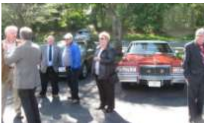
Waiting for the show to start