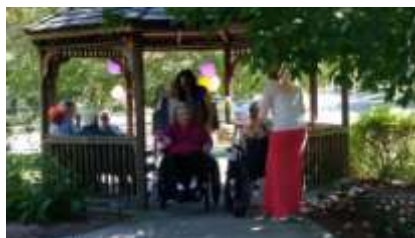
Residents enjoying the shade in the gazebo