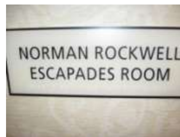
Different areas have different names. The theater is named for Charlie Chaplin