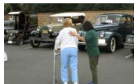
A resident admiring the cars