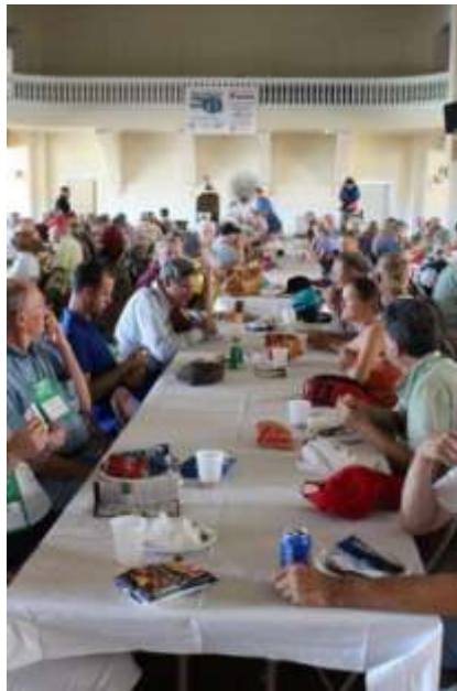
Lunch at the Masonic Temple