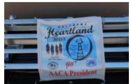
Guess who's banner this is...