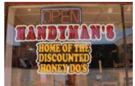
Get everything on your To Do list!