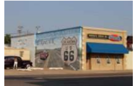
We get our kicks on Rt. 66