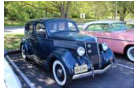
3 rd Place: LeRoy Gearhart