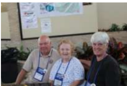
Jersey region contingent