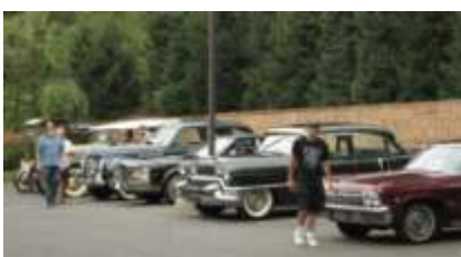
Cars lined up, ready for the residents