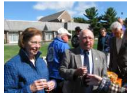
This is what friends are for!