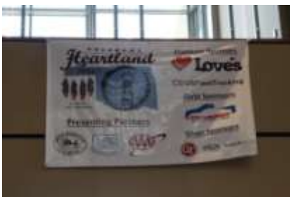
2015 Glidden Tour