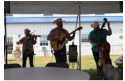
Lunch time entertainment at the Masonic Temple