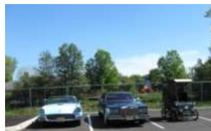
Three of four vehicles awaiting show time