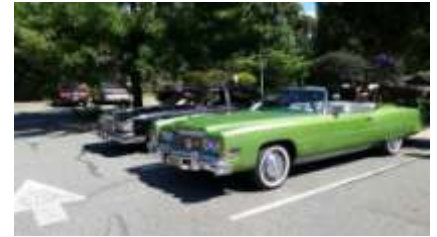
L to R, 85 Cadillac, 74 Cadillac