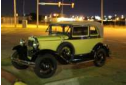
Night time drive