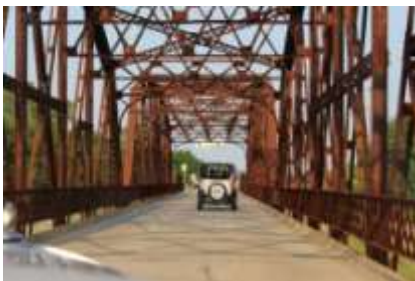
Sure hope he knows how to get there