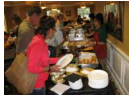
The food line at Avalon