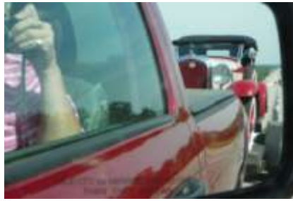
The Road Home