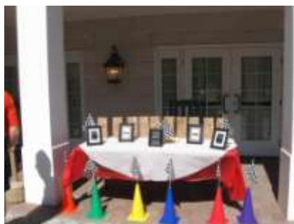
Table set up for voting, part of the “show”