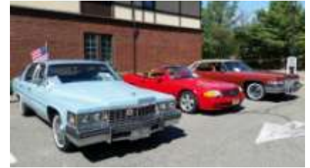
L to R, 77 Cadillac, 92 Mercedes, 76 Cadillac