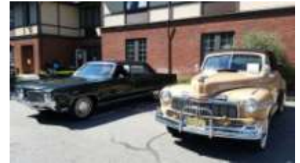
L to R, 69 Oldsmobile, 46 Mercury