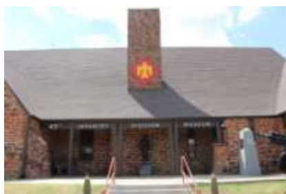
45th Infantry Museum