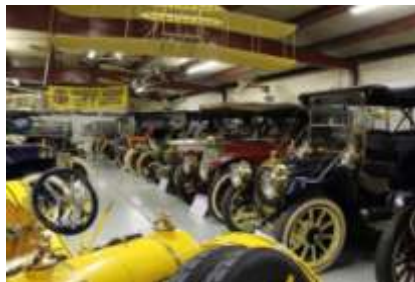
Don's cars...some of them, anyway