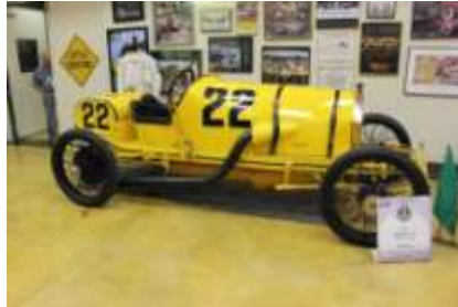
Just a race car