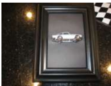
Car decorations were abundant