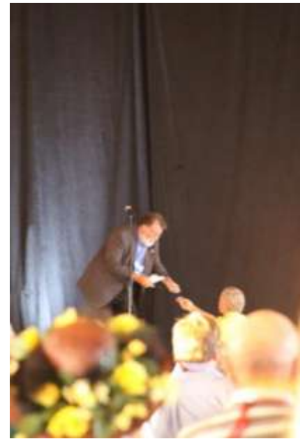
Closing banquet-AACA pres and awards