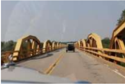
The road to Ft. Reno