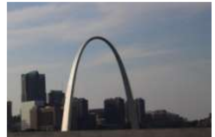
The Arch on the way home