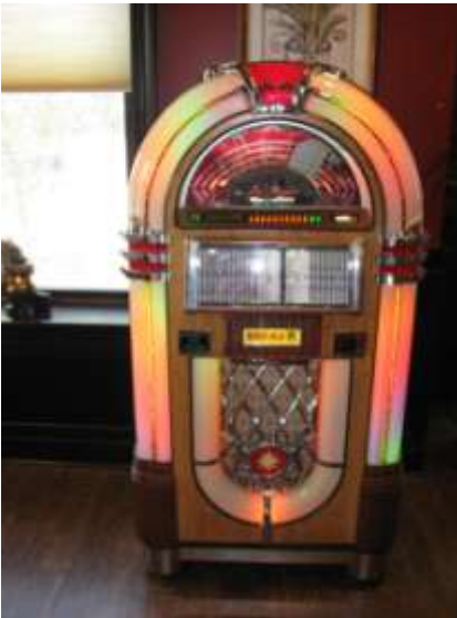
Every tap room has to have a juke box