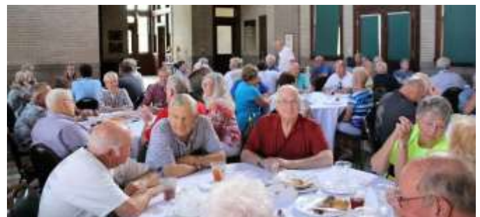
Opening and closing banquets were in RR stations