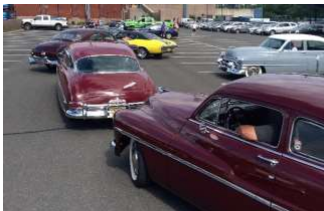
Lining up for the parade around the ball field