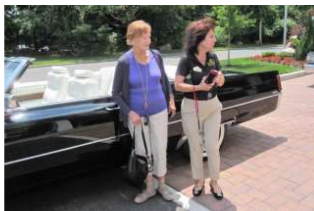
Staff & residents alike came out to look at cars