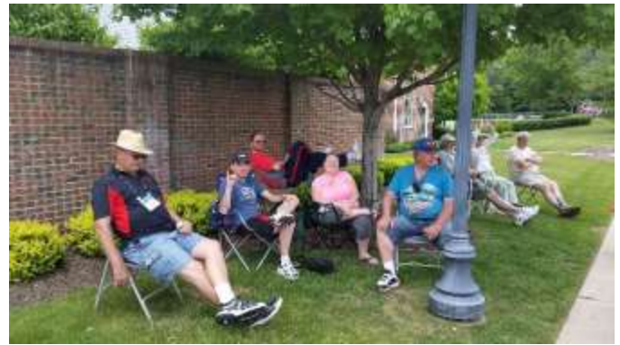
Members hiding in the shade. It looks like the "bookends" are snoozing!