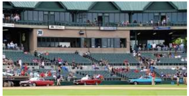
Cars on parade