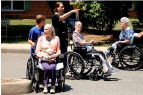
Residents lined up to see the cars