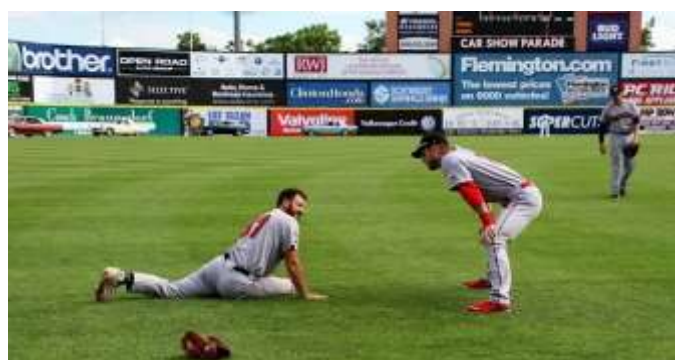
Players doing pre-game stretches