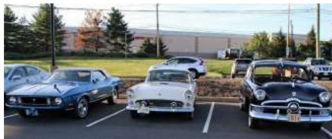
The "Zimmerman" cars