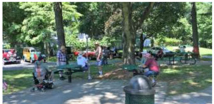
Members and residents talking cars. What else?