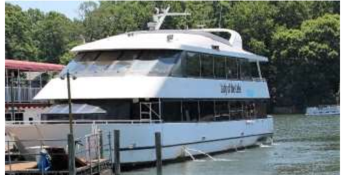
Lunch cruise on Lake Norman