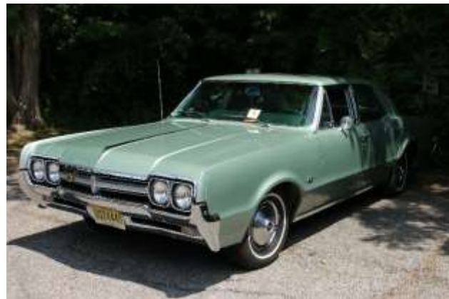
Yvonne Kunz's '66 Olds F-85