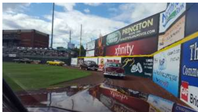
Cars parading on the warning track