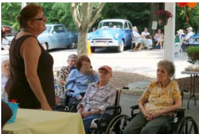
Residents and club members staying in the shade