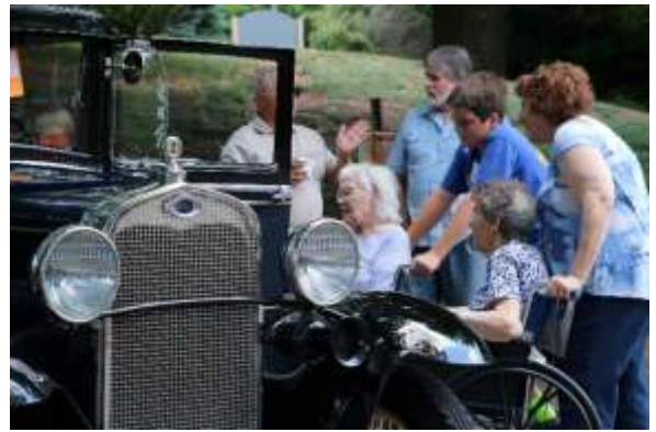
Everyone's favorite car