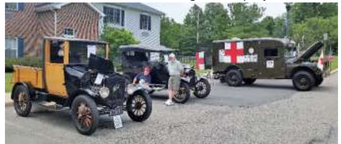
1925 Ford, 1923 Ford, 1968 Jeep