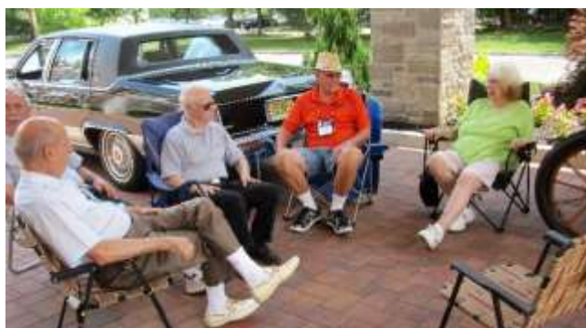
Members staying cool in the portico