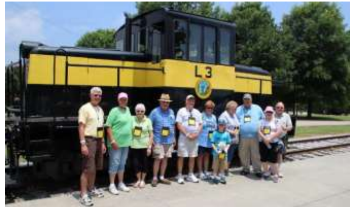
The NJ Region AACA contingency

We had fun. If you have never experienced an AACA tour, I would heartily recommend you do so.