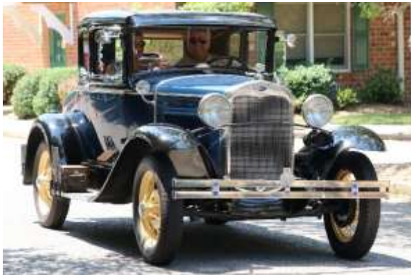
The Bagley's in their Model A Ford