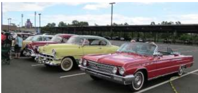
Members cars on the "Show Field"