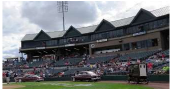
Cars on parade