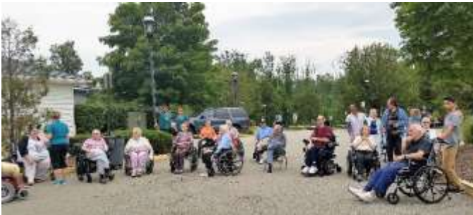
Residents enjoying the dance party