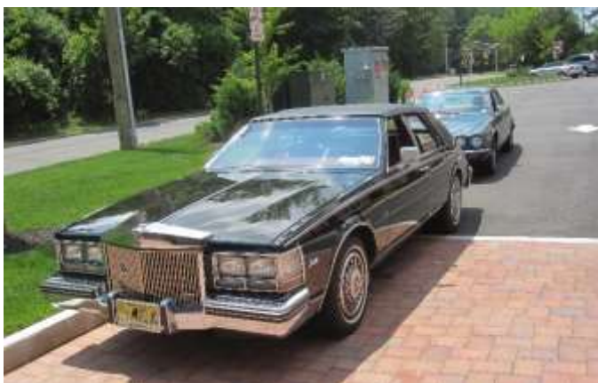
Bernie Cooney & Ed Geller, performing their 1 st chore, parked in a No Parking zone!