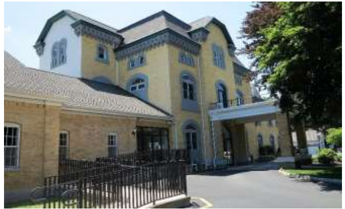
The New Jersey Fireman's Home