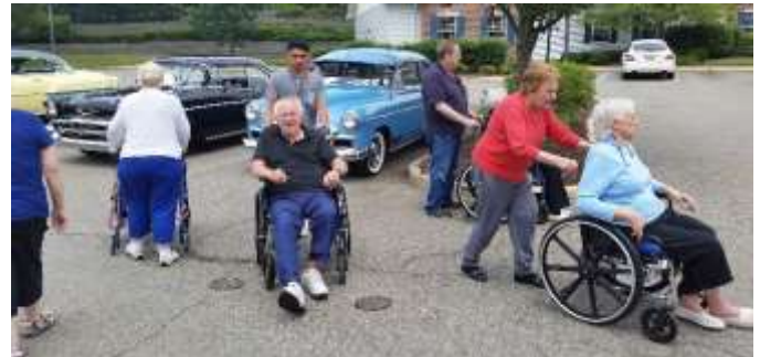
Residents admiring the display