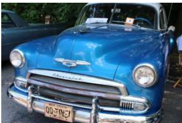
The Figorotta's '51 Chevy Skyline