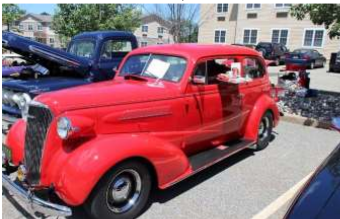
3 rd Place winner modified 1937 Chevrolet