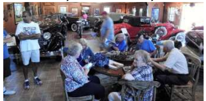
Taking a break in the Classics by the Creek Bdg.