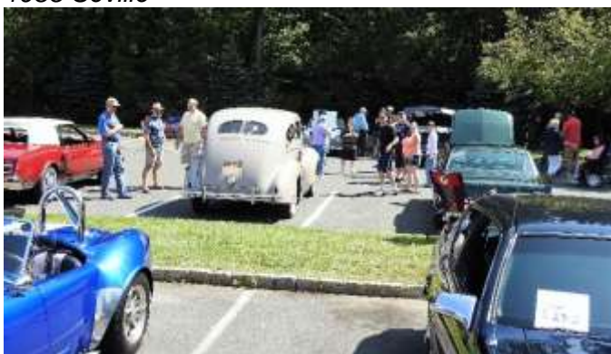
View of the assembled automobiles and enthusiasts