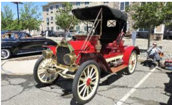
2 nd Place winner, 1908 Staver