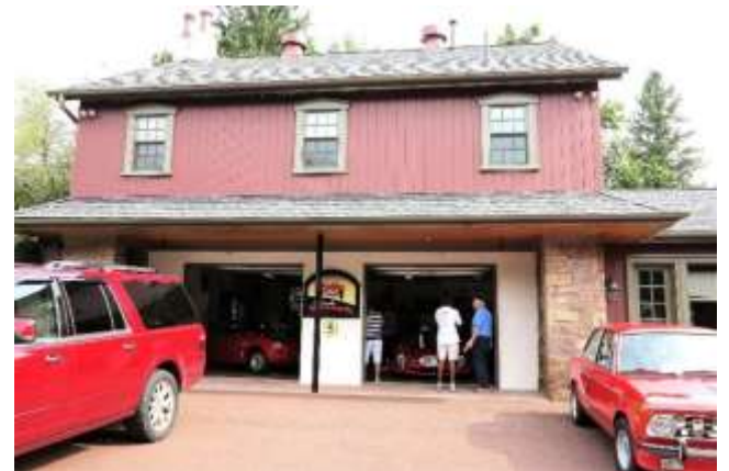
Building 1: the high octane stable