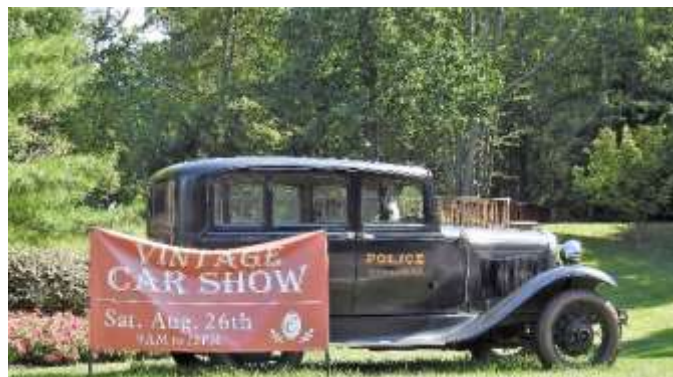
The Chelsea facility owner's Model A Ford at the entrance