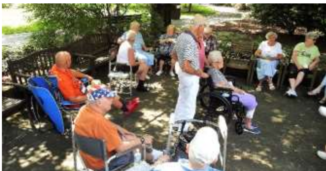
A resident and family discussing the cars