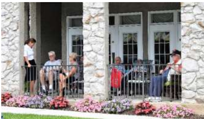
Residents on the veranda taking in the view