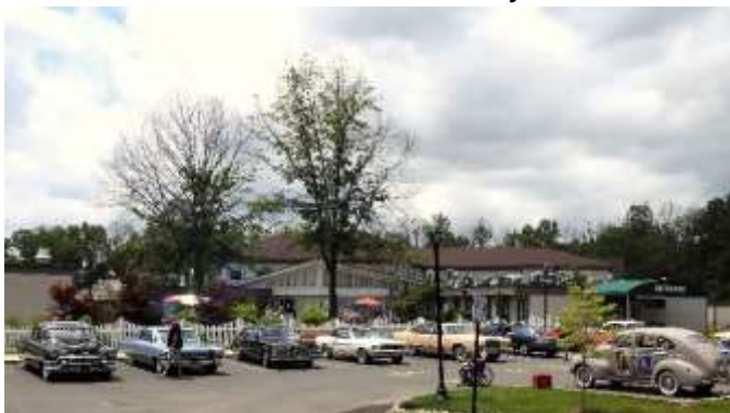
Show cars in the rear parking lot of the facility