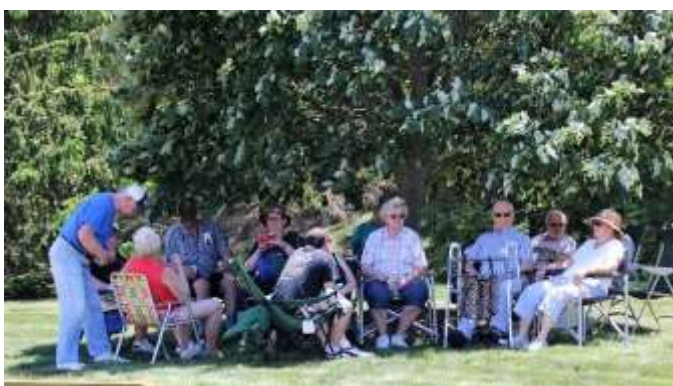
Region members seeking shade!