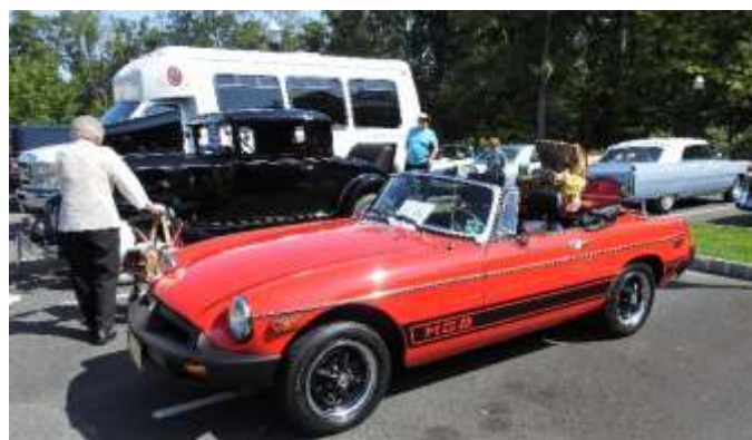
Rich Hammer's 1978 MG B