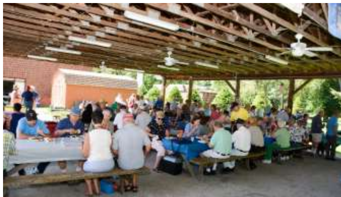
Members enjoying their food