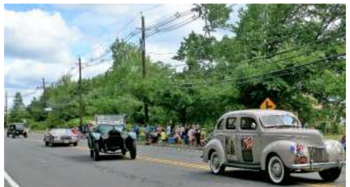
Our cars parading