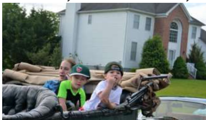
The Achtel boys are ready to ride