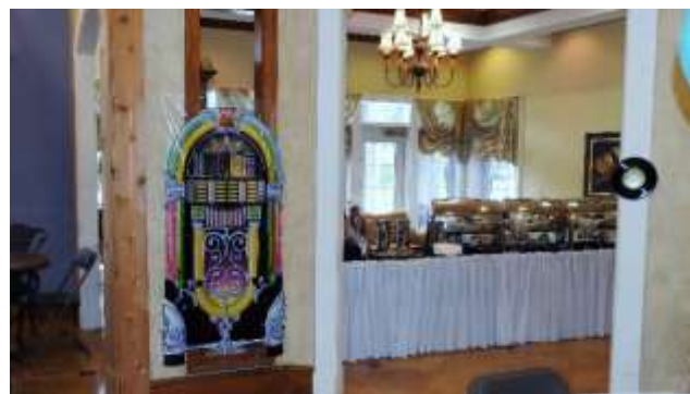
Interior decorations for "Fifties Night."