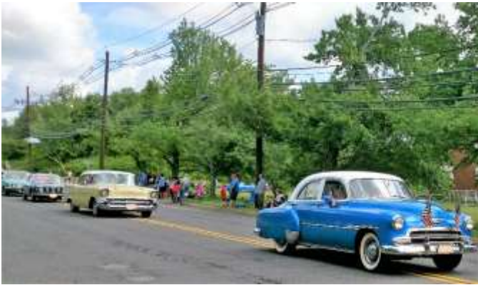
Our cars parading