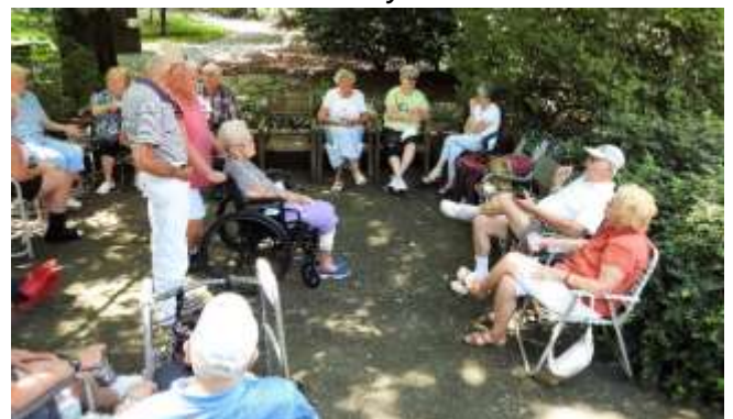
A resident and family discussing the cars