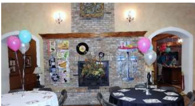
Interior decorations for "Fifties Night."