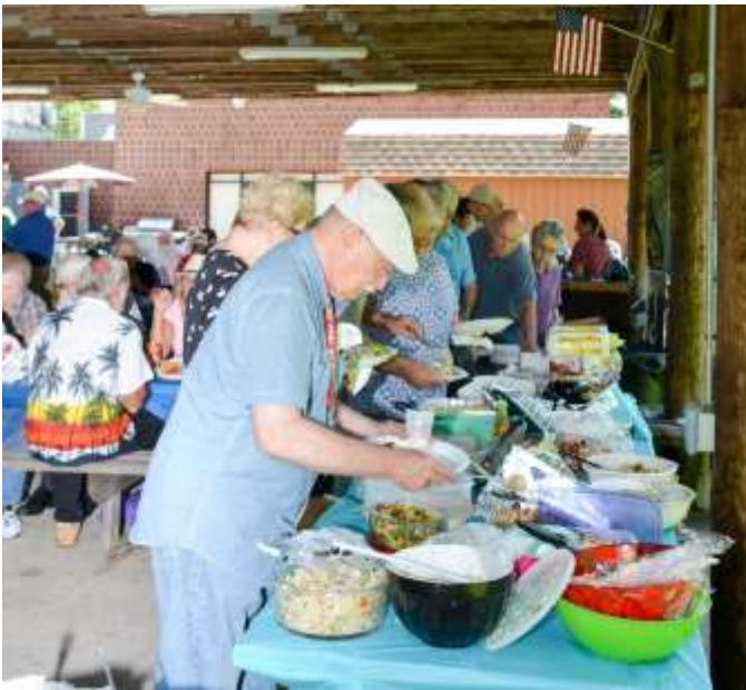
Members getting their food