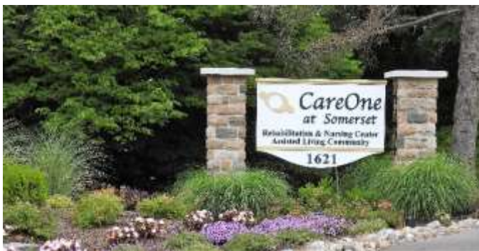
Entrance to the facility