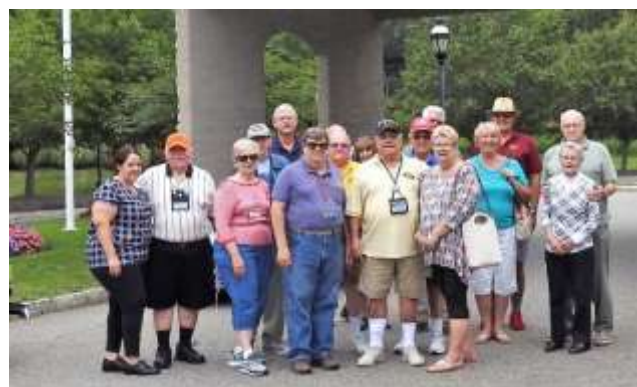
Waiting for the prize to be awarded