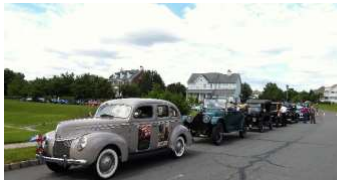
On the starting line - 1939 Ford Fordor, 1913 Stevens-Duryea, 1923 Ford Model T, 1925 Ford Model T Pickup, 1927 LaSalle and 1946 Chevy Pickup.