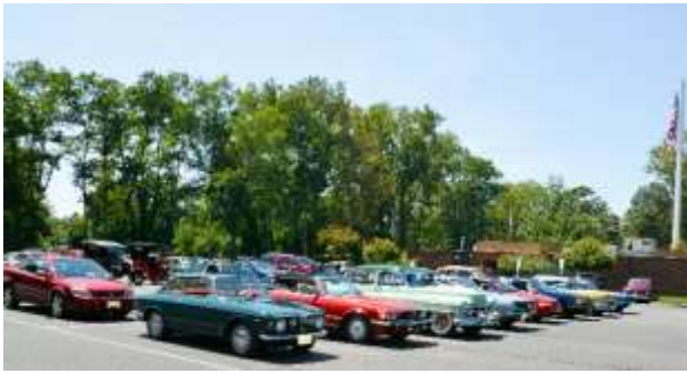
Member's cars on display