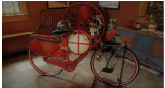
Custom built fireman's support motorcycle