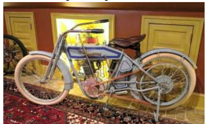
1912 Harley Davidson Silent Grey Fellow