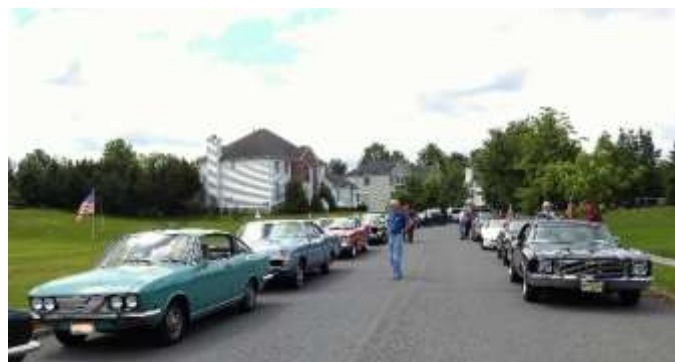
Rich Reina wondering what the delay is