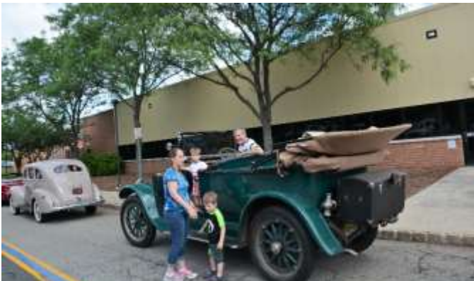
The parade is over!