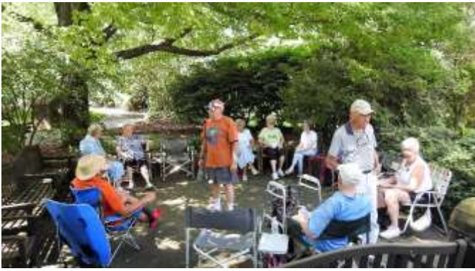
NJAACA Members staying in the shade