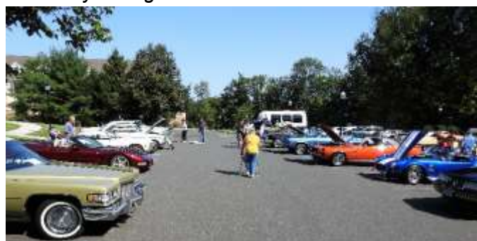
View of the assembled automobiles