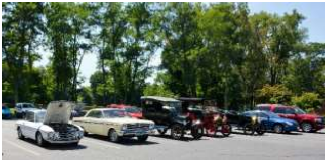
More Member's cars on display