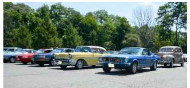
More Member's cars on display