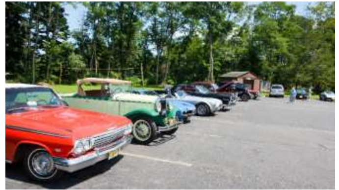
Some of the many member vehicles on display