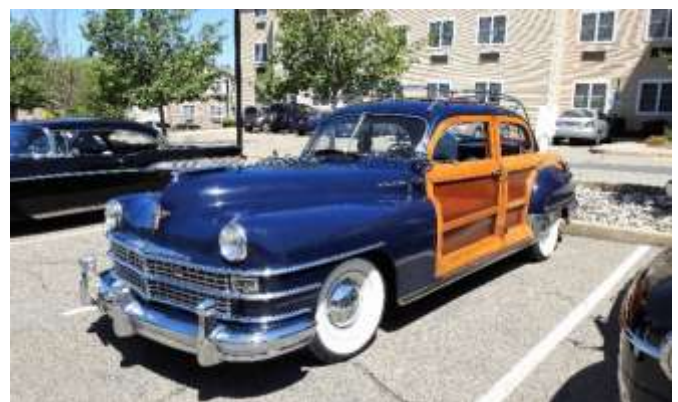
1 st Prize winning 1947 Chrysler Town & Country