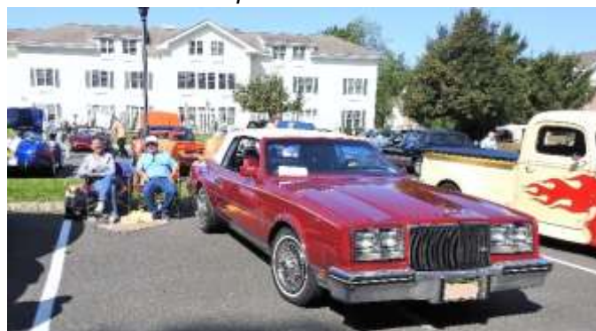
The Bagley's, their puppy & their 1982 Rivera