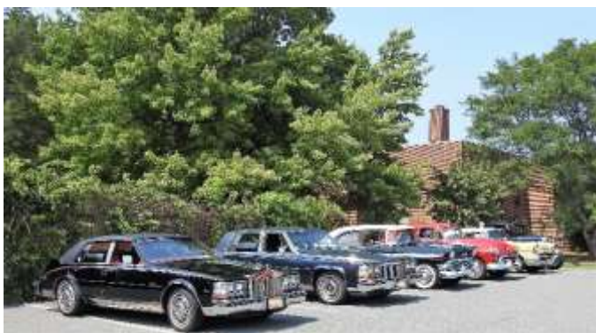
Some of our cars lined up for show