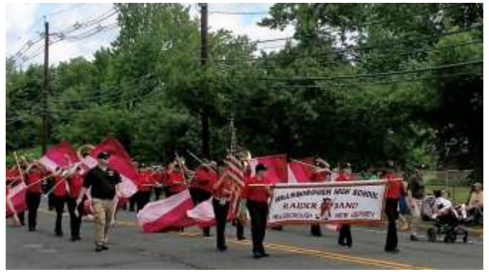
The Hillsborough High School Red Raider Band, which we followed in the parade.