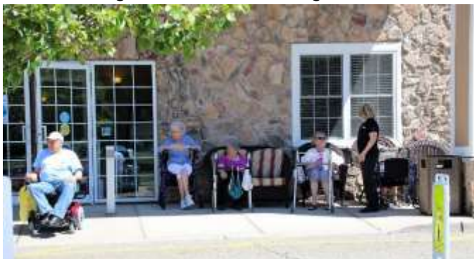
Residents taking in the view