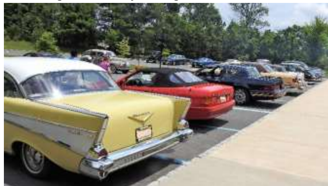
A view of all 14 cars at the event!