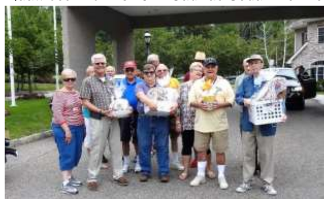
Celebrating with the winners