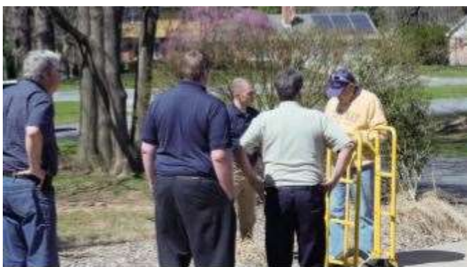
Photos from the unloading of the Theisen Collection

Actually, we have a great relationship and I'm sure any and all of her comments were in jest because we are always "poking fun" at each other. But none the less, her kidding me caused me to take a harder look at the answers, of which there are many. The article I picked for this issue from the AACA Rummage Box is a very important reason and one of the answers. I suggest you read it.