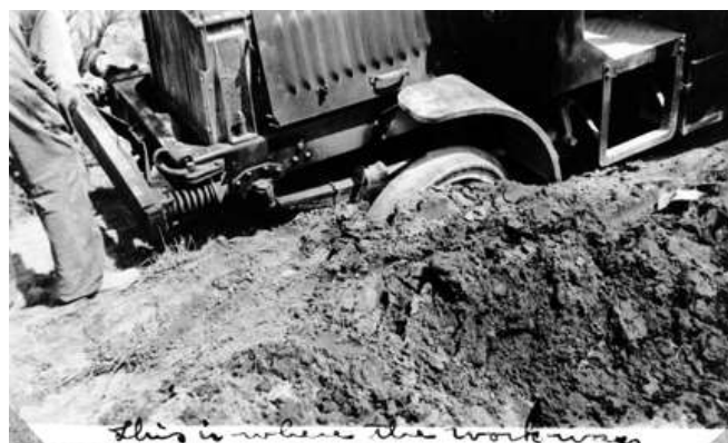
"This is where the work is"