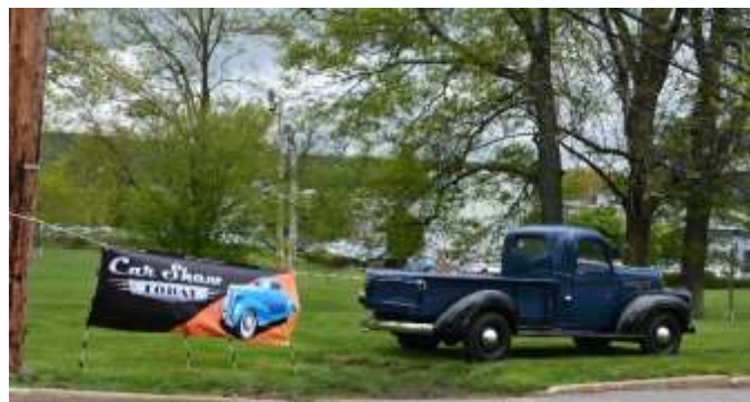
Oh, there's a car show!!