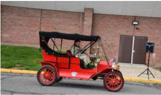
Herb Singe entering the show field!