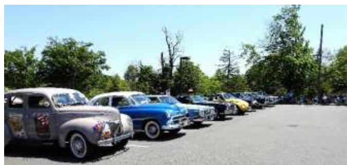
Members cars on display