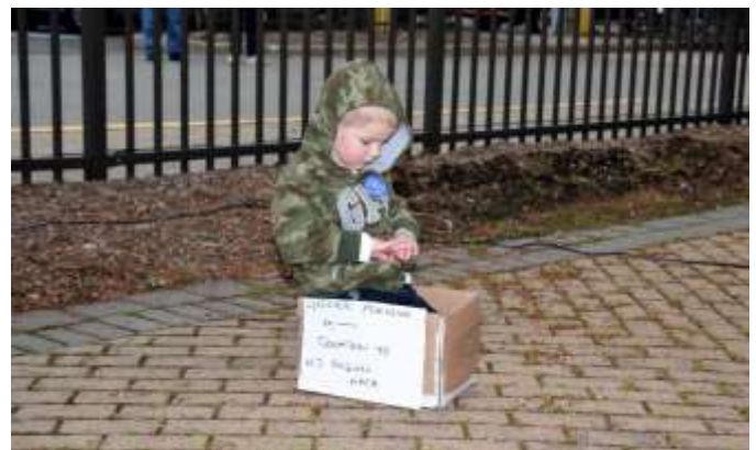
Give a kid a box and .....