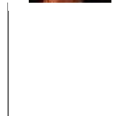
Open Spring Meet Book Sale