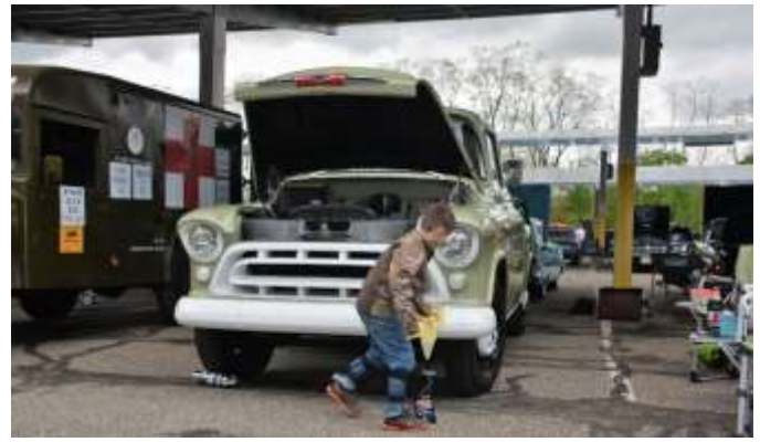
Showing cars is a family affair!