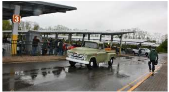
The rain came and the vehicles left!