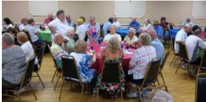
The temperatures were so hot at the 2016 Region Picnic that it was held indoors!

Route 80 West to Exit 19. Turn left onto Route 517, then turn right onto route 46 west (at the 3 rd traffic light) Take Route 46 west (9.6 miles from last traffic