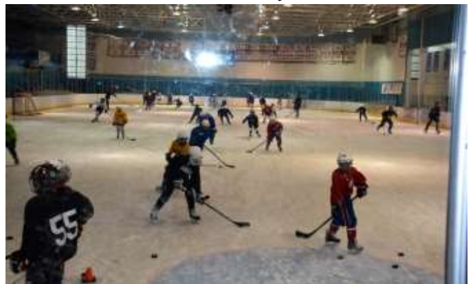
Kids playing hockey in the arena