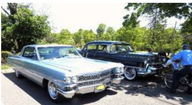
Has anybody seen a Cadillac? The guy on a bicycle want to trade it for one!