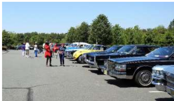
Residents and staff enjoying the antique automobiles