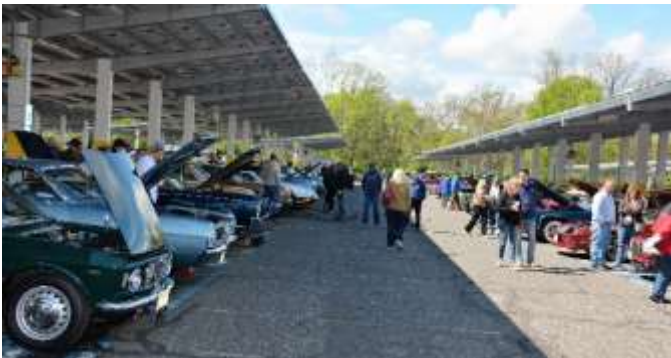
The Show field