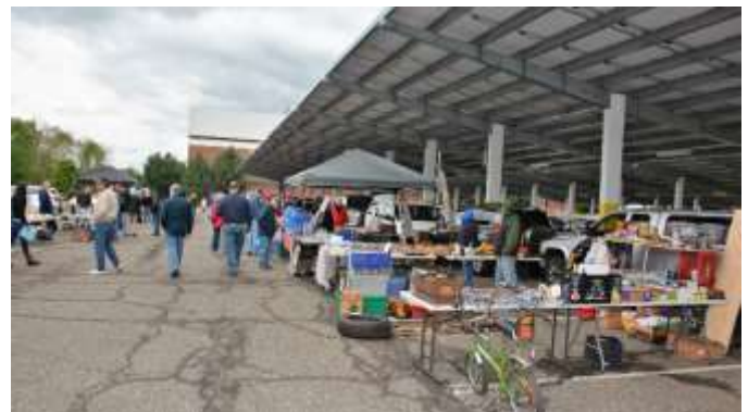
The Flea Market