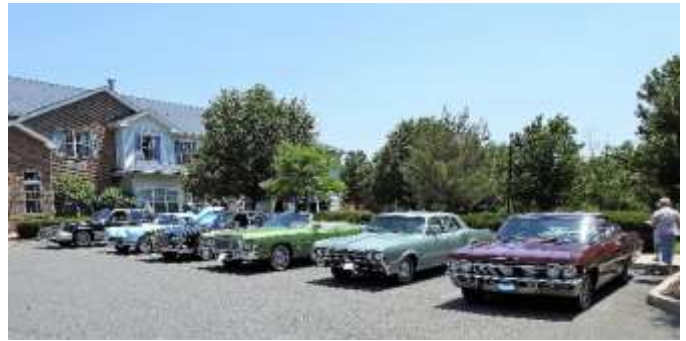
Participants cars being displayed