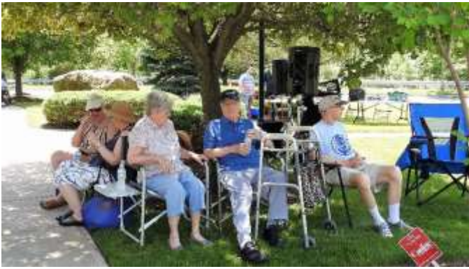
Shade was very popular!