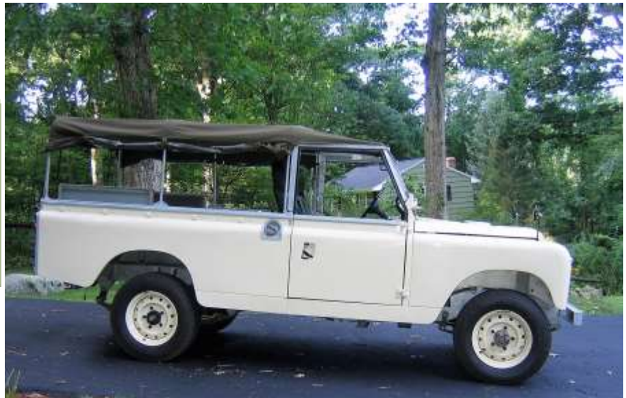
1966 Land Rover Series IIA 109 Pickup owned by Tim Schimmel, No. 41 in 2016 Participation Points