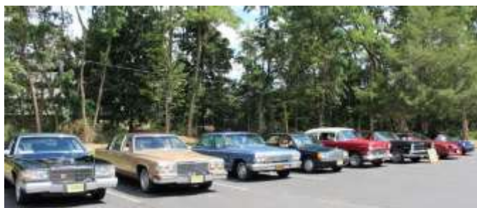
The region's 2 nd largest car show, the picnic!