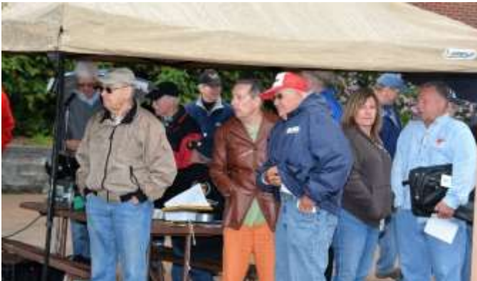
Participants finding a dry spot!