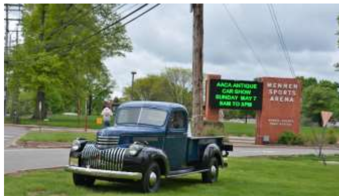
Hey, what's that old Chevy truck doing there?