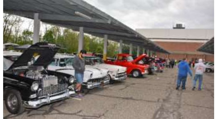
The Show field