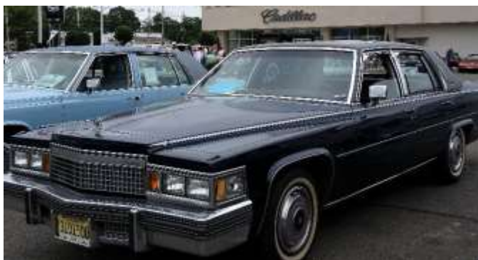
The Road Map – July 2017

1979 Cadillac Deville, four door sedan with sun roof classic V-8 engine, original paint in great shape, loved and garaged, second owner, leather upholstery, 8 track with tapes! Approximately 76,000 miles Loaded: AC, AM/FM, Automatic Climate Control, 8 track, Cruise Control, Driver Multi-Adjustable Power Seat, Front Split Bench Seat, Full size Spare Tire, Wire wheel covers, Interval Wipers, Owner's Manual, Power Brakes, Power Locks, Power Seats, Powered windows, Rear Defroster, Tilt Wheel, Tinted Windows, Woodgrain interior. We have lowered the price to $3500.