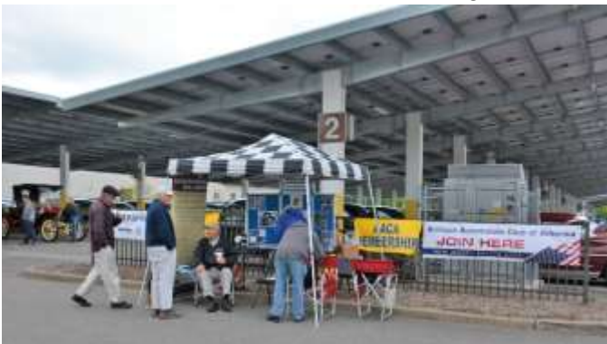
The NJ Region Membership tent