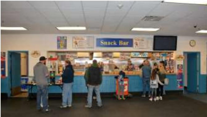
The indoor snack bar