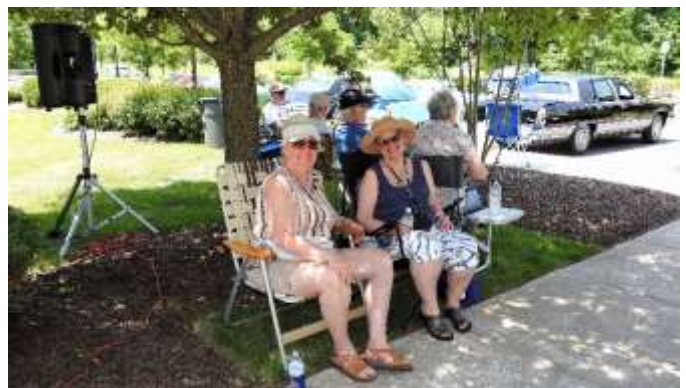
Members hanging out in the shade