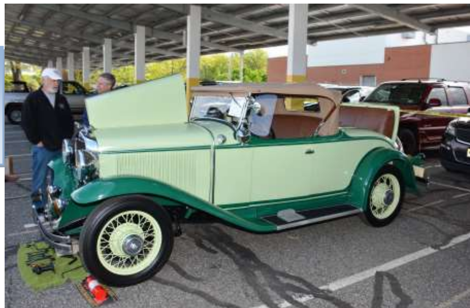
1932 Dodge Owned by, Bob Smith No. 18 in 2016 Participation Points (File photo)