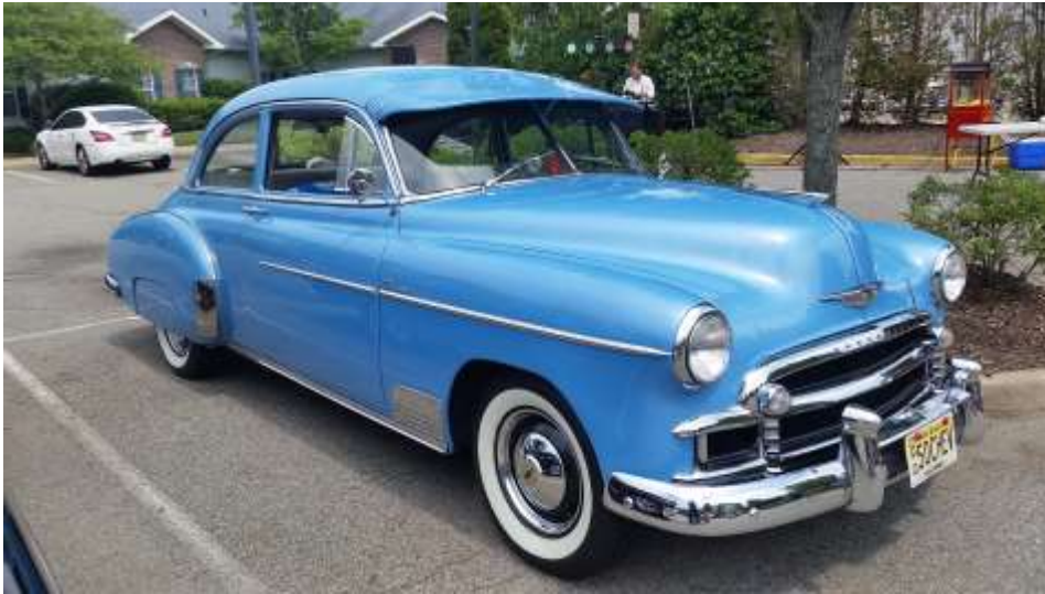
1950 Chevy Bel Aire Owned by Bob Kelly, No.30 in 2016 Participation Points (File photo)